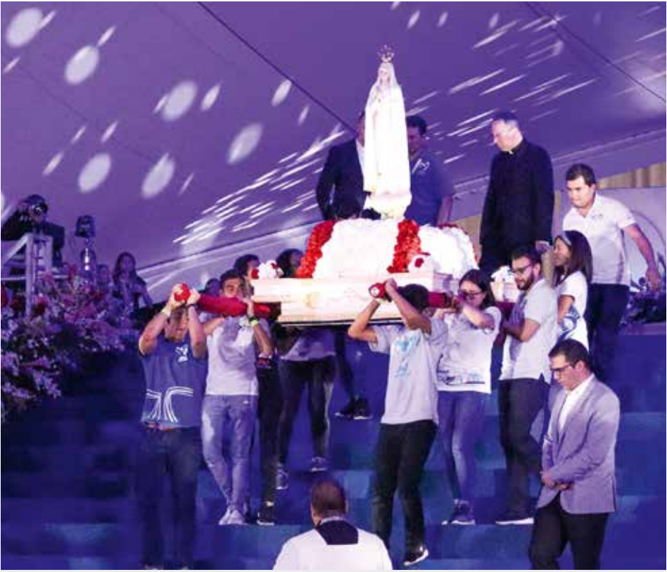
Statue of the Pilgrim Virgin of Fatima was carried by the young people of AMF Panamá, at the vigil of World Youth day 2019

Between the months of April and August, the Statue of the Pilgrim Virgin No. 4 will be in several dioceses in Italy, in a tour promoted by the Marian Movement Messaggio di Fátima in Italy.