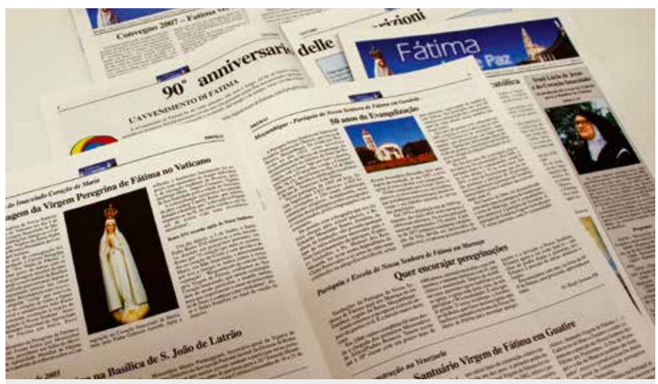
The journeys of the Pilgrim Virgin of Fatima were emphasised in the pages of the Bulletin

after the inauguration of the celebratory space.