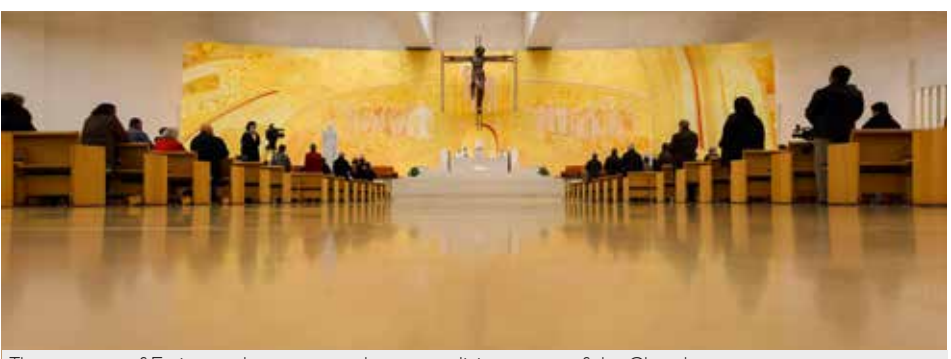
The message of Fatima makes us aware that we are living stones of the Church

The Church of the Holy Trinity was dedicated on October 12, 2007 by Cardinal Tarcísio Bertone, then Vatican Secretary of State and Pope Benedict XVI's papal legate for the closing of the 90th anniversary of the Apparitions of Our Lady to the three little shepherd seers.