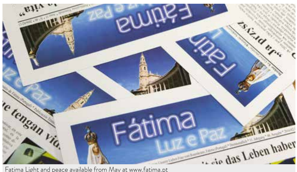
Fatima Light and peace available from May at www.fatima.pt

Suspension of the paper edition poses new challenges to the international bulletin of the Shrine of Fatima / Carmo Rodeia