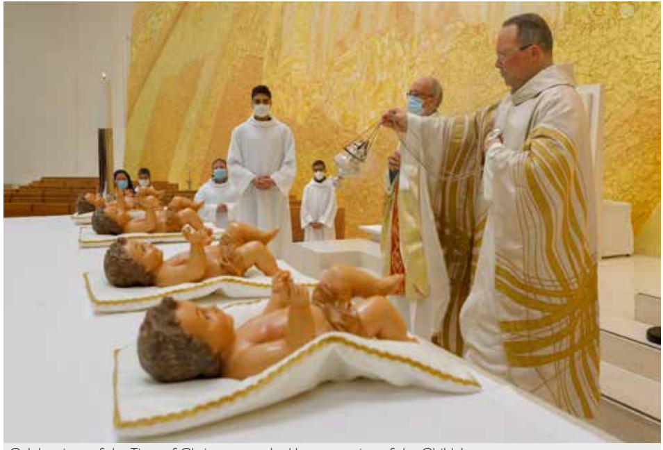
Celebrations of the Time of Christmas marked by veneration of the Child Jesus

The Shrine of Fatima guaranteed the Christmas and New Year celebrations, respecting the safety rules set out in the contingency plan