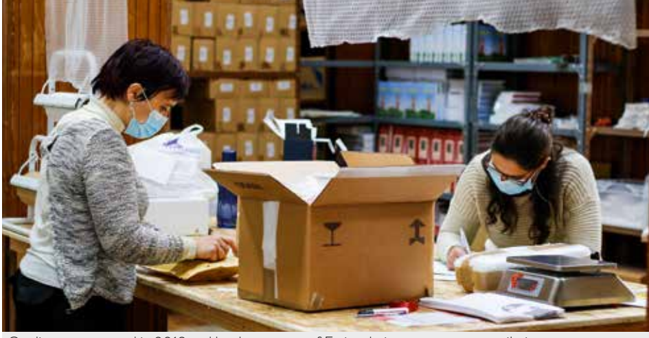
On-line store started in 2018 and has been a way of Fatima being present among pilgrims all over the world

In this time of pandemic, when pilgrims cannot travel to the Shrine, the purchase of their official products has been a form of presence