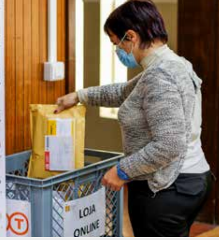
The on-line store sells all the official items of the Shrine

lation restrictions, there was an increase in demand for products online. Those who buy in this space available on the internet are 64% women and 36% men,