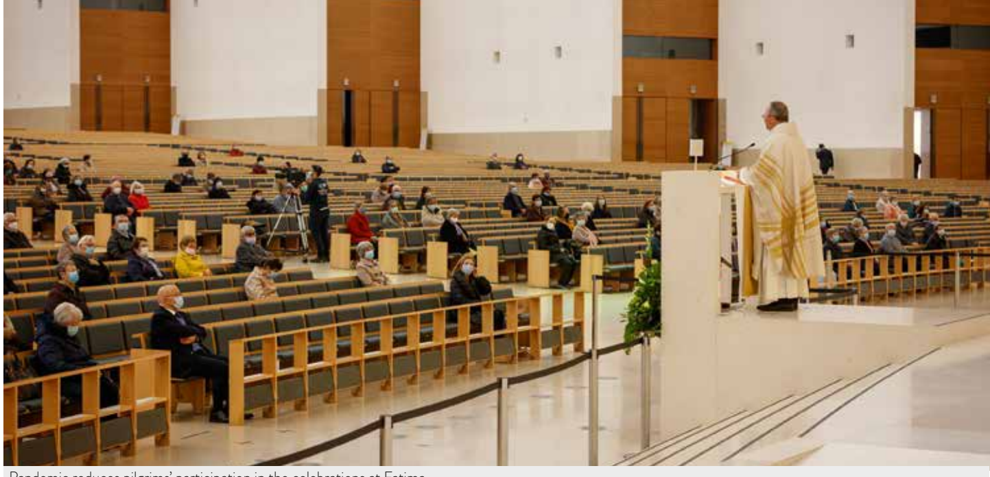
Pandemic reduces pilgrims' participation in the celebrations at Fatima