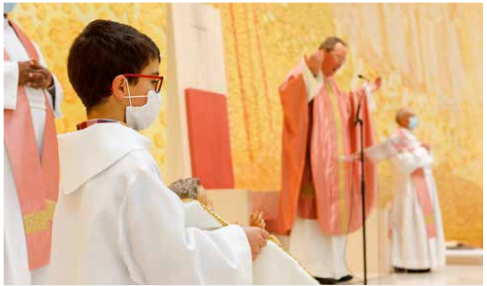
In the Sunday of Joy there is the blessing of the images of the Child Jesus

This celebration was broadcast on the digital media at the Shrine of Fatima.