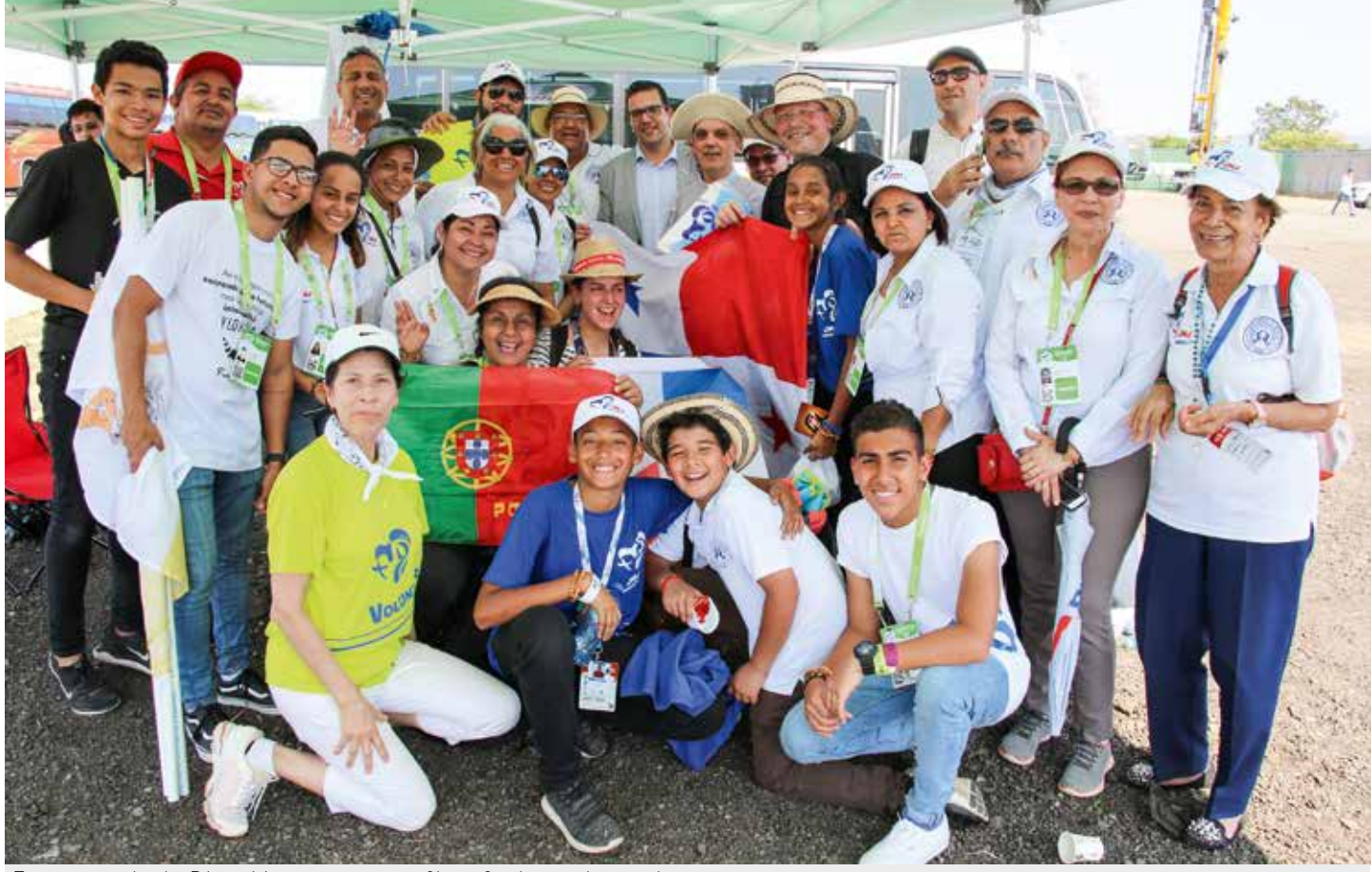
Every journey by the Pilgrim Virgin is a moment of hope for those welcoming her

A replica of the Little Chapel of the Apparitions is under construction in this Latin American country