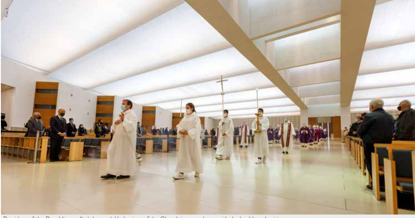
President of the Republic recalled the model behaviour of the Church in accordance with the health authorities

"Suffering and death cannot be confined" Eucharist for the victims of the pandemic brought together 21 bishops and national authorities in Fatima, recalling health professionals, researchers and caregivers.