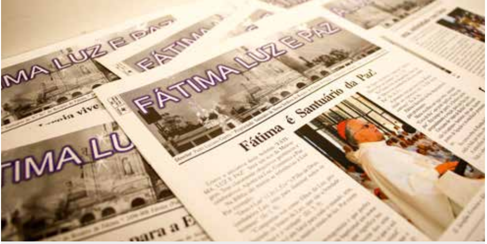
The issue of Peace, being central to the message of Fatima, has always been highlighted in the bulletin

Fatima, "Shrine of the Holy Trinity", could be read on the front page of the November 13, 2007 edition, one month