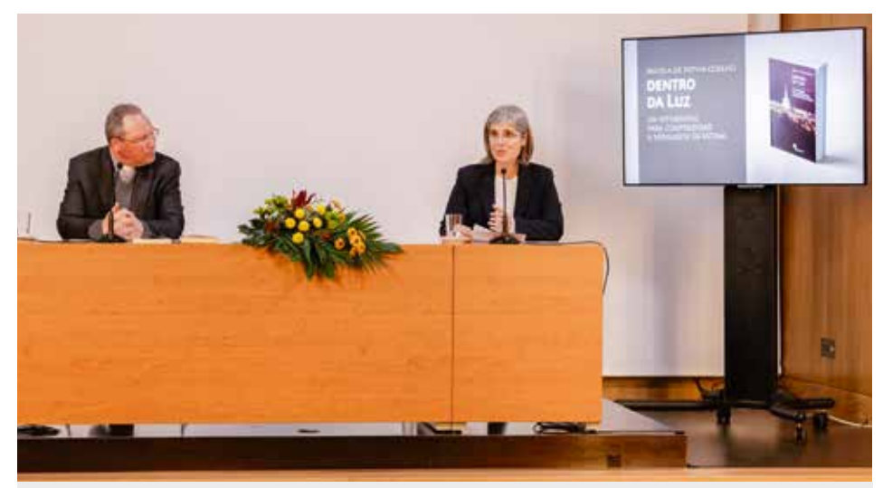
Book presentation made through the digital media of the Shrine of Fatima

The book Inside the Light is for sale in bookstores and in the online store of the Shrine at <u>https://store.fatima.pt/</u>