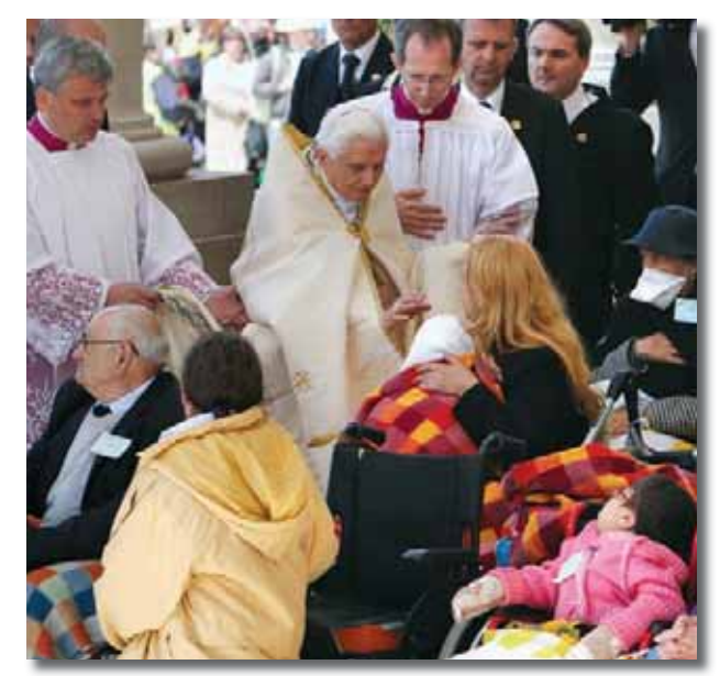
During the Mass of May 13, as it is always the case in Fatima, the sick received

the Blessing of the Sick, this time from the hands of Pope Benedict XVI. 428 children and adults signed up to receive the blessing.