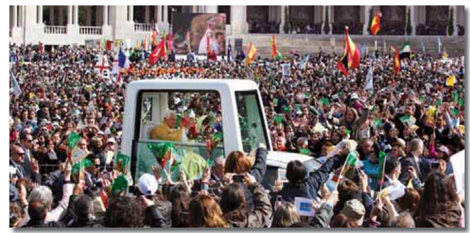
The Mass of May 13 was presided over by the Pope and concelebrated by 1442 priests, 77 bishops and 44 cardinals. Signed up for participation in this Mass were 214 groups of pilgrims from 40 countries. During this international pilgrimage of May 2010, 332 pilgrims were attended to at the First-Aid Station of the Shrine; 782 fulfilled their promises; and 5966 received the Sacrament of Reconciliation.