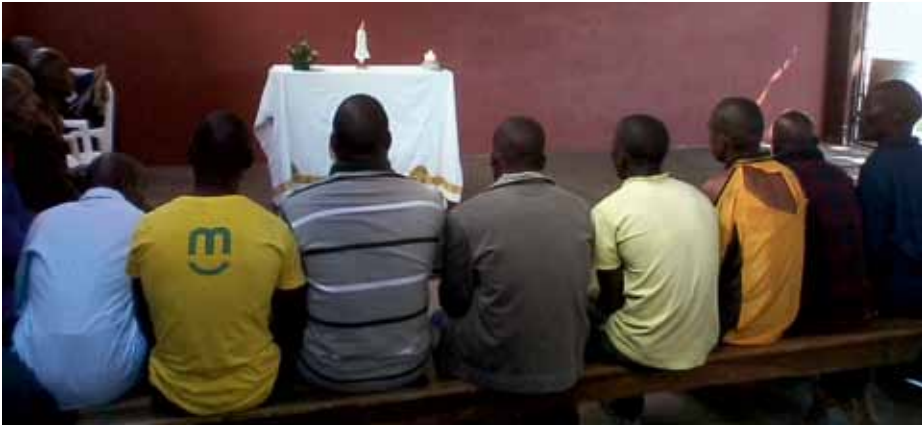
Deprived of freedom, but free to unite Heaven and Earth through Maria

A few weeks ago, a prisoner of the Maputo Central Penitentiary asked me if we could start praying the rosary in prison. I accepted with joy his request and suggested him the organization of prayer, asking the other inmates if they were interested in this initiative. On May 7, Wednesday, at 10:30 am, we met in the garage, where the Catholic community of prisoners is accustomed to pray and around a small and beautiful image of Our Lady of Fatima, offered by the Sanctuary of Fatima, we began to pray with a group of 17 inmates.