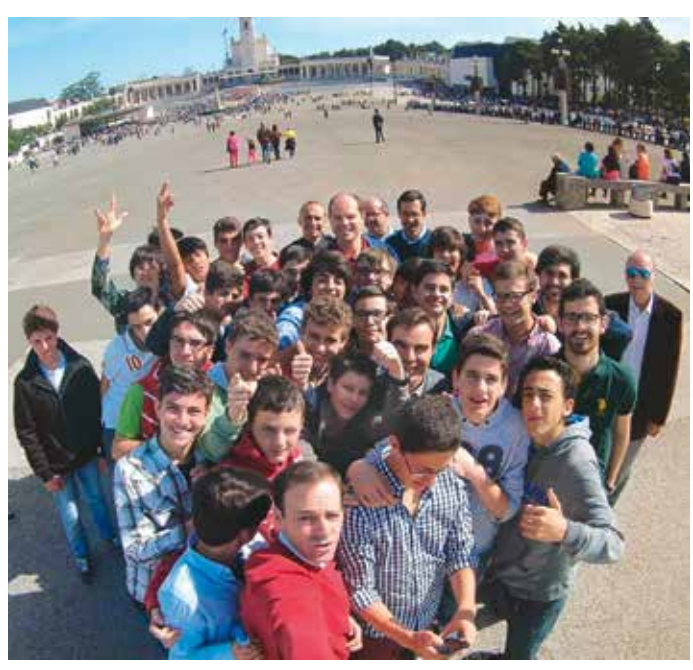
Young people of Opus Dei in the annual youth meeting during Holy Week

The International Meeting of Fatima – MIF – is a youth meeting that takes place during the Holy Week and carries out a variety of sporting and cultural activities in Fatima.