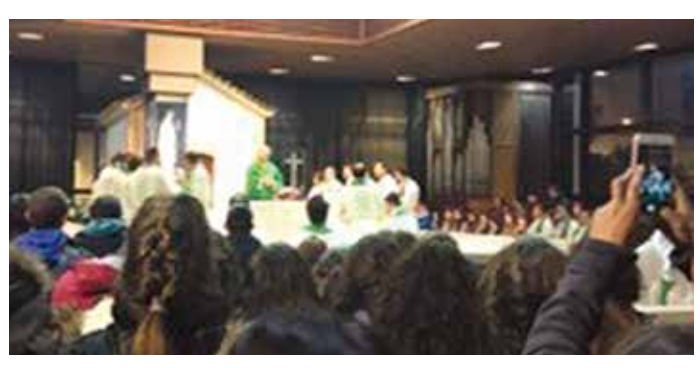
Spanish group offered a ostensorium to the Shrine of Fatima

«We generally begin in November with letters directed to parishes, to monasteries and convents, asking them to pray for the success of the pilgrimage. Thereafter, we make videos and news