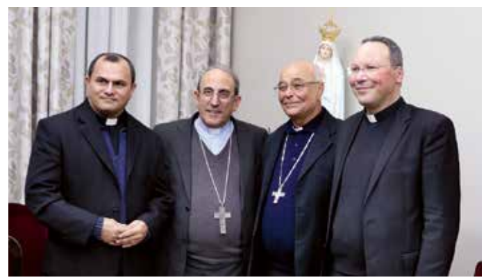
Fatima Parish of Aracaju realizes a pilgrimage to the Shrine in November