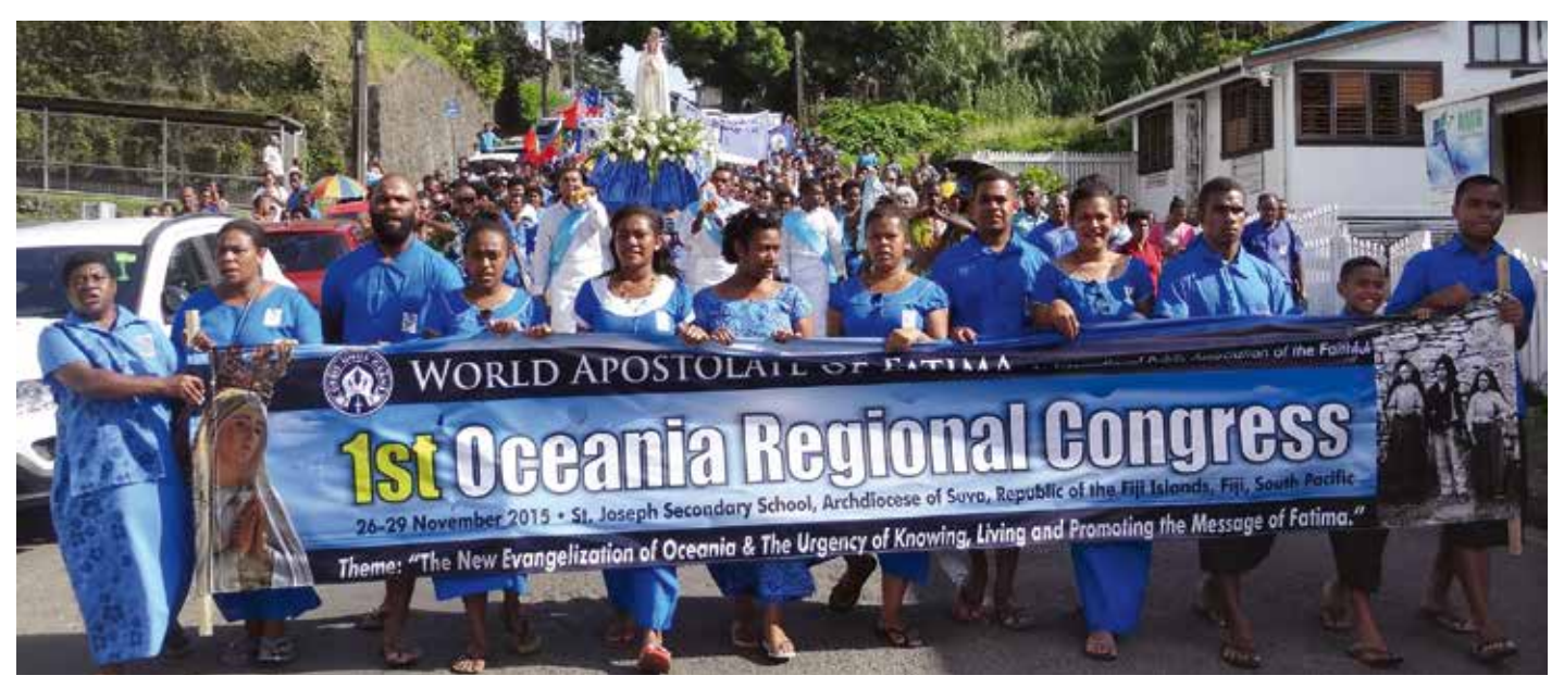
Fiji Islands received first Congress on the Message of Fatima

The World Apostolate of Fatima hosted its first congress on the message of Fatima for the Oceania region, in the archdiocese of Suva, in Fiji Islands, from the 26th to 29th November 2015. The four days program revolved around the theme: "The New Evangelization of Oceania and the urgency of living and promoting the Message of Fatima". The event brought together hundreds of people devoted to Our Lady, from Fiji Islands and from some neighbouring countries such as Australia, Samoa, Salomon and American Samoa islands and others representatives from more distant places, such as the Philippines, USA, Portugal and Puerto Rico.