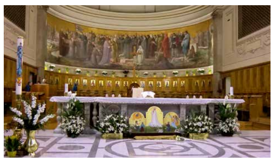
Basilica of Sant'Antonio al Laterano celebrates the day of the Little Shepherds

one of the protagonists of this event, marked the 19<sup>th</sup> of May. On this day there was also the opportunity to kiss the relics of the Little Shepherds.