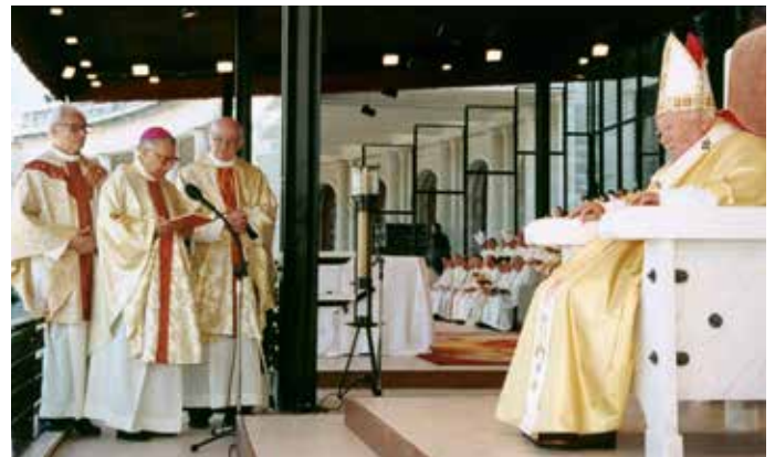
John Paul II was three times in Cova da Iria

«The Shrine of Fatima is a privileged place, with a special