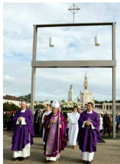
The Jubilee Portico marks the 100 years of the apparitions

“Fatima – Time and Light” is a Video Mapping show, scheduled for the nights of May 12 th , 13 th and 14 th , in the Prayer Area of the Shrine of Fatima.