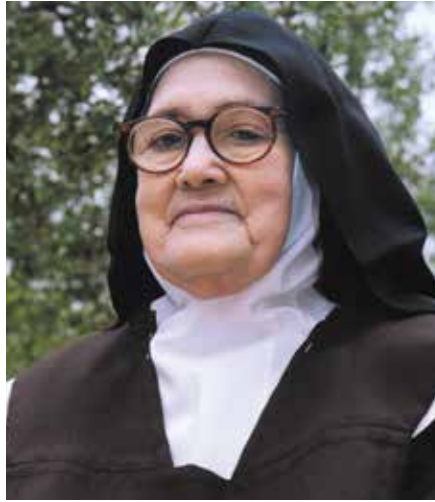
Sister Lucia deceased in February 2005

She was one of the three children who between May and October 1917 witnessed six apparitions of Our Lady in Cova da Iria, according to their testimonies, recognized by the Catholic Church. Concluded the diocesan phase of the beatification process, a 'position' will be elaborated, a compendium of the reports and studies carried by the juridical committee, by a relater nominated by the Congregation for the Causes of Saints (Holy See).