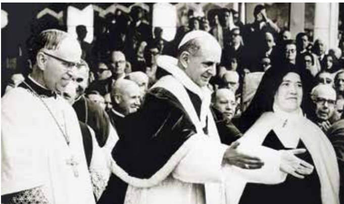
Paul VI was the first Pope to visit Fatima

12 th of May, 1982 – John Paul II arrives at Fatima late