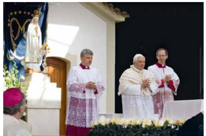
Benedict XVI visited the Shrine of Fatima in May 2010