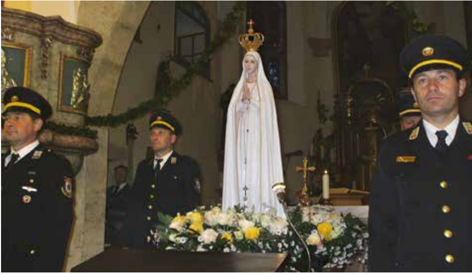
Pilgrim Virgin initiated her visit to Slovenia in May 2016

Image of Our Lady of Fatima was at the Shrine of Ptujška Gora