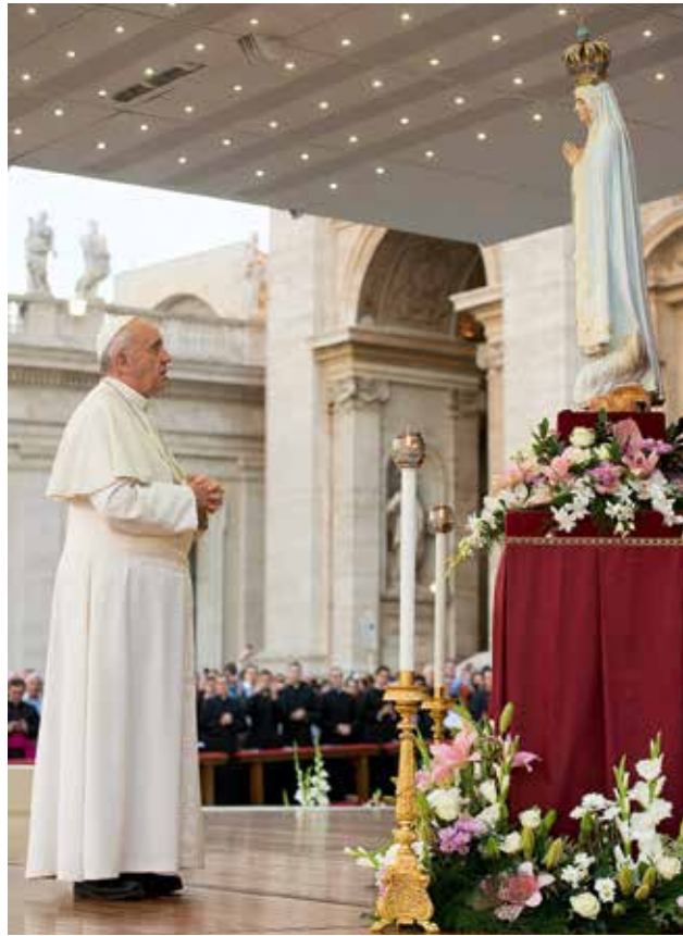
Francis was the first Jesuit elected Pope

He is, on the other side, developing a renovation of the Roman Curia, starting with the financial and administrative sector, with external