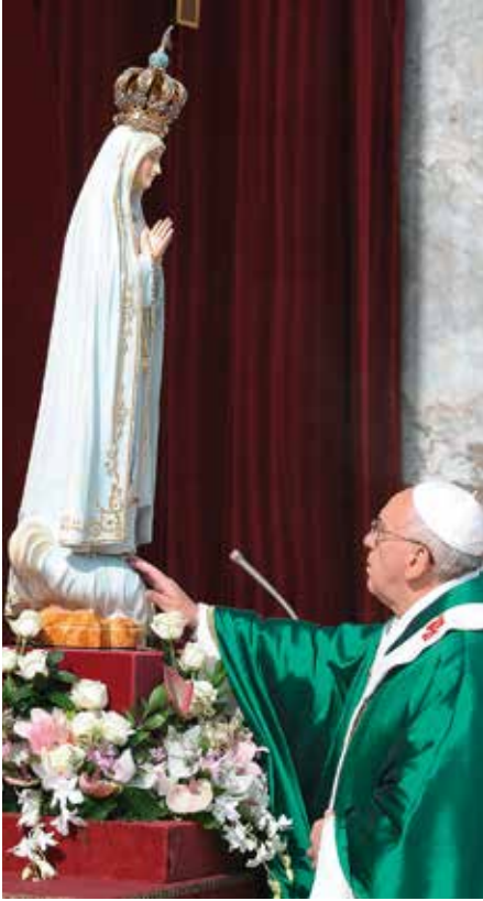
Francis wants to be a pilgrim in Fatima

Francis will come «in pilgrimage to the Shrine of Our Lady of Fatima from the 12 th to 13 th of May»