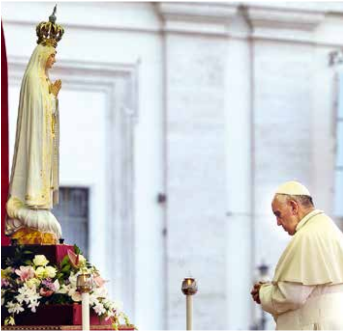
Francis consecrated his pontificate to Our Lady

Cardinal Bergoglio was elected Pope on March 13 th 2013, on the second day of the conclave, under the name Francis.