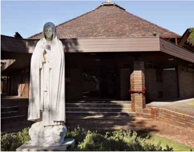
The Virgin of Fatima has a shrine in Sydney

In the Shrine of Fatima's archive there is reference to a parish dedicated to Our Lady of Fatima, near Beijing. An image of Our Lady of Fatima is found in the Everest peak. In Sidney, Australia, there is a Shrine dedicated