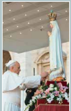
Act of entrustment to Our Lady of Fatima at the conclusion of Mass on the occasion of the Marian Day (Saint Peter's Square, October 13th, 2013)