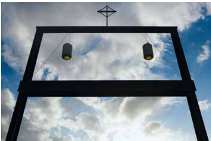
Centennial of the apparitions is marked by the Jubilee Portico

According to the Canon Law, to accomplish indulgence, which may be partial or plenary – as it partially or totally frees from the sanction due by the sinners – it is required, in addition to the exclusion of any sin fondness, the execution of the work prescribed by the Church, the Reconciliation sacraments (Confession) and the Eucharist, as well as the prayer by the Pope’s intentions.