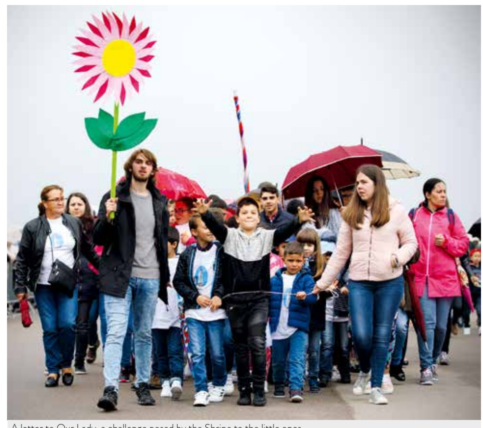
A letter to Our Lady, a challenge posed by the Shrine to the little ones

To follow that idea the present this year to the children was a letter, addressed to each one of them, with a cardboard oratory inside. The oratory reproduces the Chapel of the Apparitions and by opening it, the representation of the statue of Our Lady and the official representation of Francisco