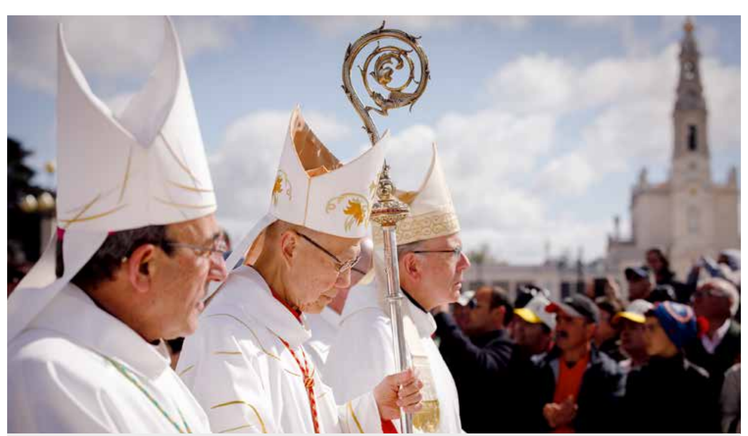
Bishop emeritus of Hong Kong was the first Asian to preside over an Anniversary Pilgrimage in Fatima

"Blessed Virgin of Fatima, turn your gaze upon us, upon our families, our country, and the world".