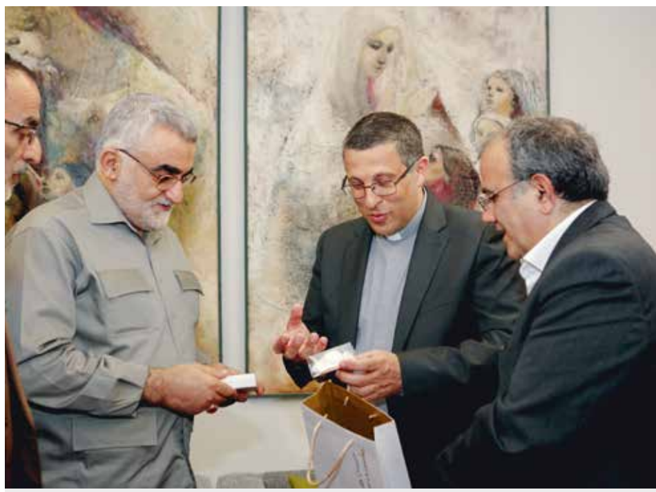
As pilgrims for peace, Iranians underlined the esteem for Our Lady

F. Vitor Coutinho underlines common motivation between the two religions for the construction of Peace / Carmo Rodeia