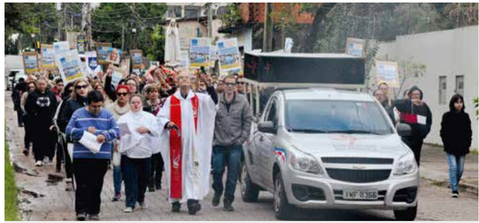
derlined the devotion to Our Lady of the Rosary of Fatima

The schools of the municipalities and public, that belong to the student parish, had the joy to receive the Pilgrim Statue / Rubens Monteiro