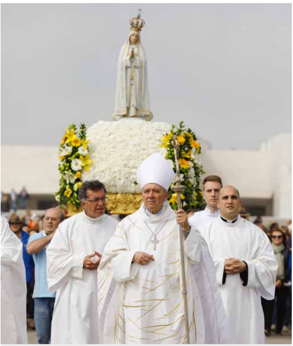
Bishop emeritus of Santarém enhanced the importance of the Message of Fatima in present day

"God had crowned the life of Our Lady with grace and mercy, which are source of hope of being accompanied and protected by Her maternal love. That is what happened in the Wedding at Cana and in Fatima... This is now, today, with those who believe in Him and follow Him, like Mary, His Mother".