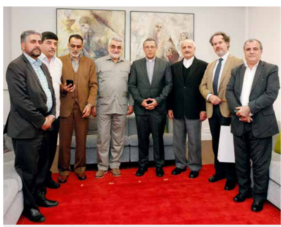
Parliamentary delegation in Fatima to visit the Shrine

The Vice-Rector also underlined the "kind relation" the Shrine has with Eastern countries "because of the history of the events and the Message of Fatima", especially with the Ukrainian community, one of the first immigrants community in the country "with which strong bonds were tied". Two Ukrainian priests assist the Shrine of Fatima to welcome, in a permanent way, this community, who visit very often Cova da Iria.