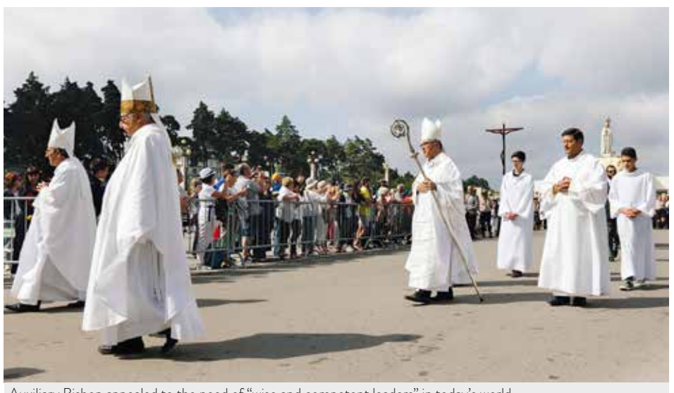
Auxiliary Bishop appealed to the need of "wise and competent leaders" in today's world

"The pilgrimage is a holy journey, a spiritual experience of prayer, of inner silence, of search of the light and truth, of purity of heart, of reconciliation, of conversion and the peace within us, with God and the others".