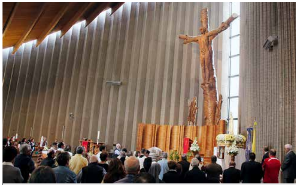
Italians prayed for peace in front of the Pilgrim Statue

The fruits of grace conceded by the Lord