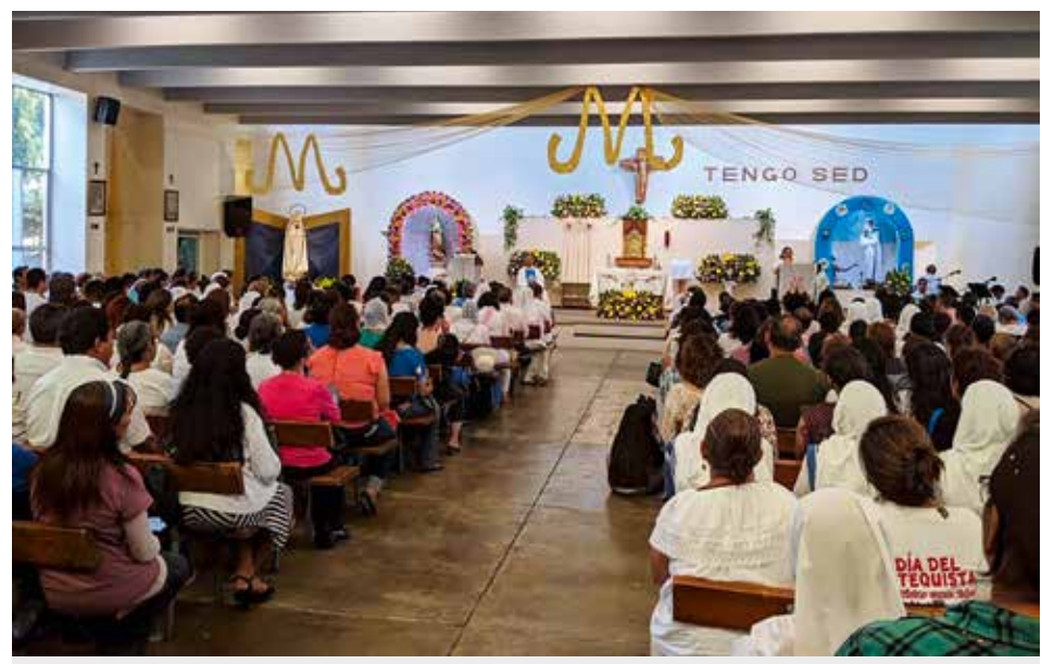
For 33 days, the pilgrims prepared for the arrival of the Image

To better enjoy this grace, there was a previous preparation with a visit of Father