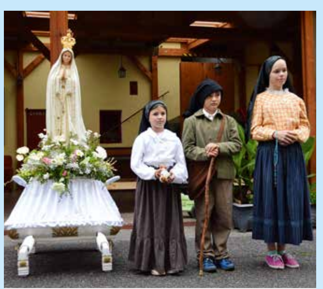
Five First Saturdays devotion is increasingly widespread all over the world