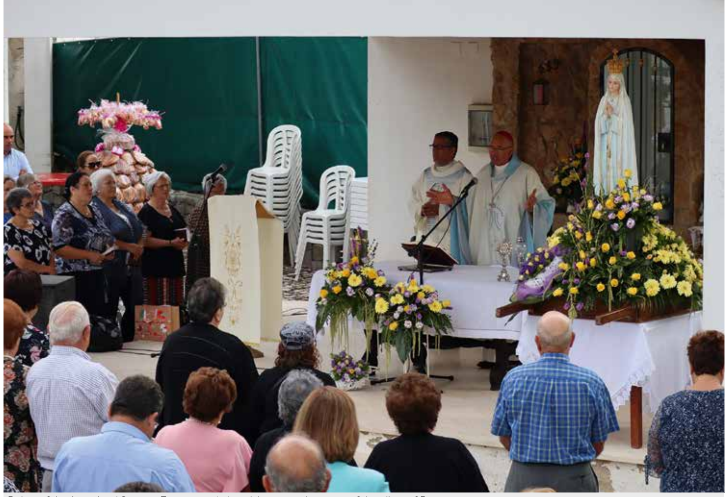
Bishop of the Armed and Security Forces presided a celebration in the centre of the village of Barrenta

A recess built in 2001, hosts the annual celebration