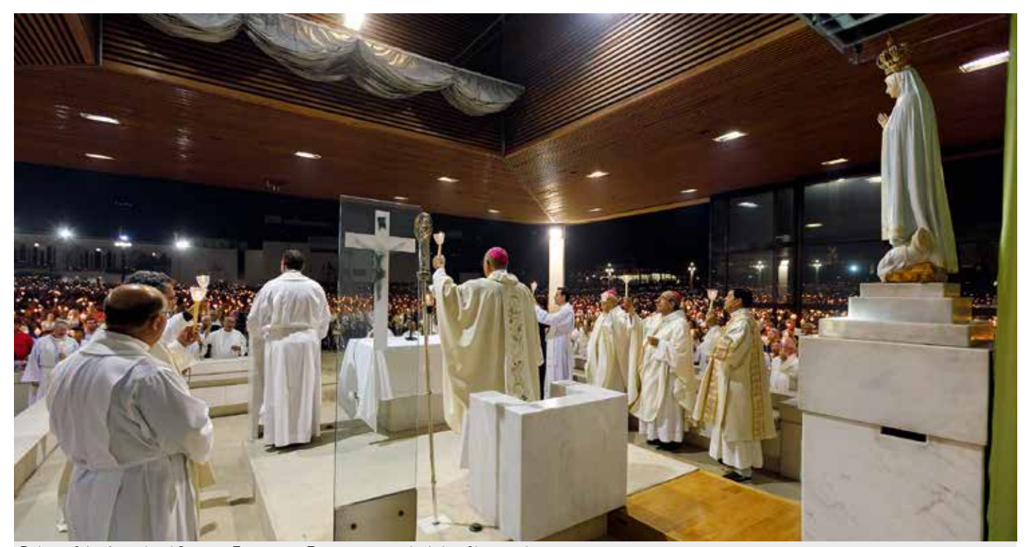
Bishop of the Armed and Security Forces says Fatima restores the light of hope to humanity

87 groups of pilgrims had registered for this pilgrimage and they came from 23 countries: Portugal, Germany, Australia, Brazil, Cape Verde, South Korea, Slovakia, Spain, USA, France, Netherlands, Indonesia, Ireland, Italy, Poland, Singapore, Burkina Faso, Canada, China, Czech Republic, Philippines, South Africa and United Kingdom. 115 priests, 5 bishops and 1 cardinal concelebrated the event.