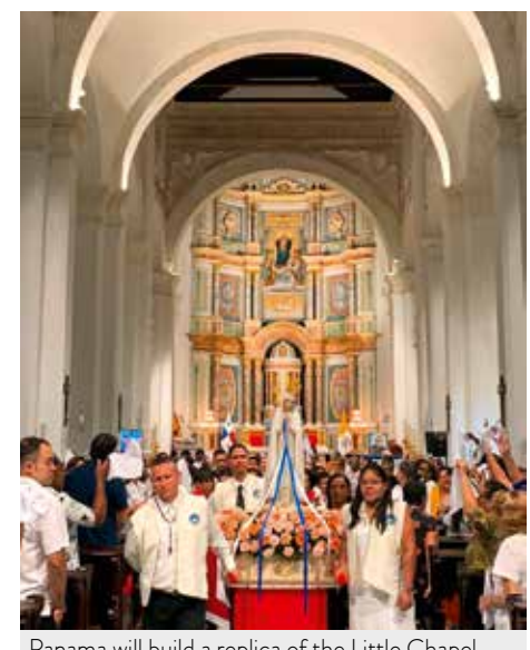
Panama will build a replica of the Little Chapel of the Apparitions.

The archdiocese of Panama occupies an area of 13,275 square kilometres divided into 93 parishes. An estimated 633,705 Catholics live in the country.