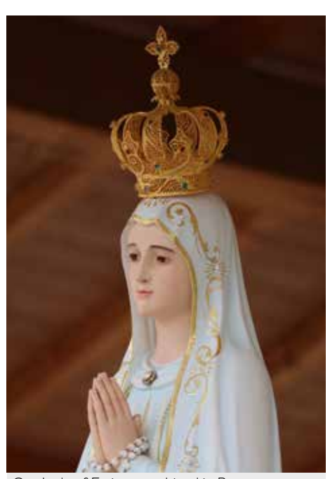
Our Lady of Fatima worshiped in Barrenta

The recess was built by the local population in order to show their devotion to the graces received from Our Lady of Fatima