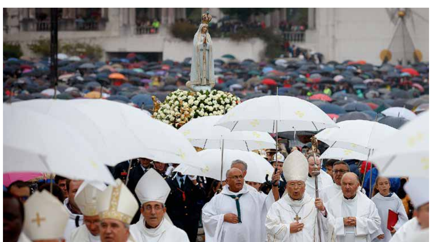
The rain did not discourage the thousands of pilgrims who participated in the celebrations

The International Anniversary Mass of October, which closes the cycle of the great pilgrimages of 2019, was concelebrated by 2 cardinals, 11 bishops and 232 priests.