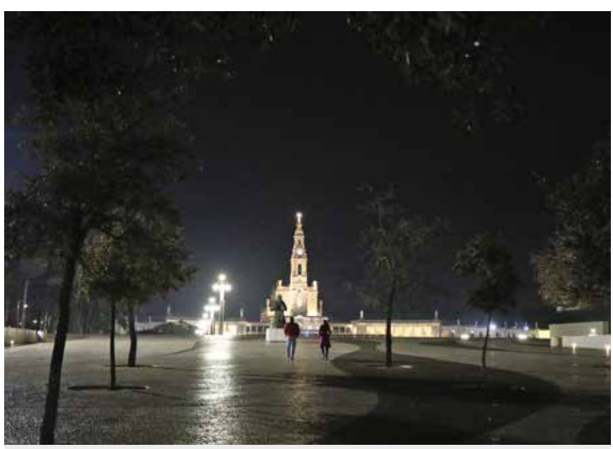
The frequency of the celebrations changes with the arrival winter

For more detailed information, please consult <a href="https://www.fatima.pt">www.fatima.pt</a>