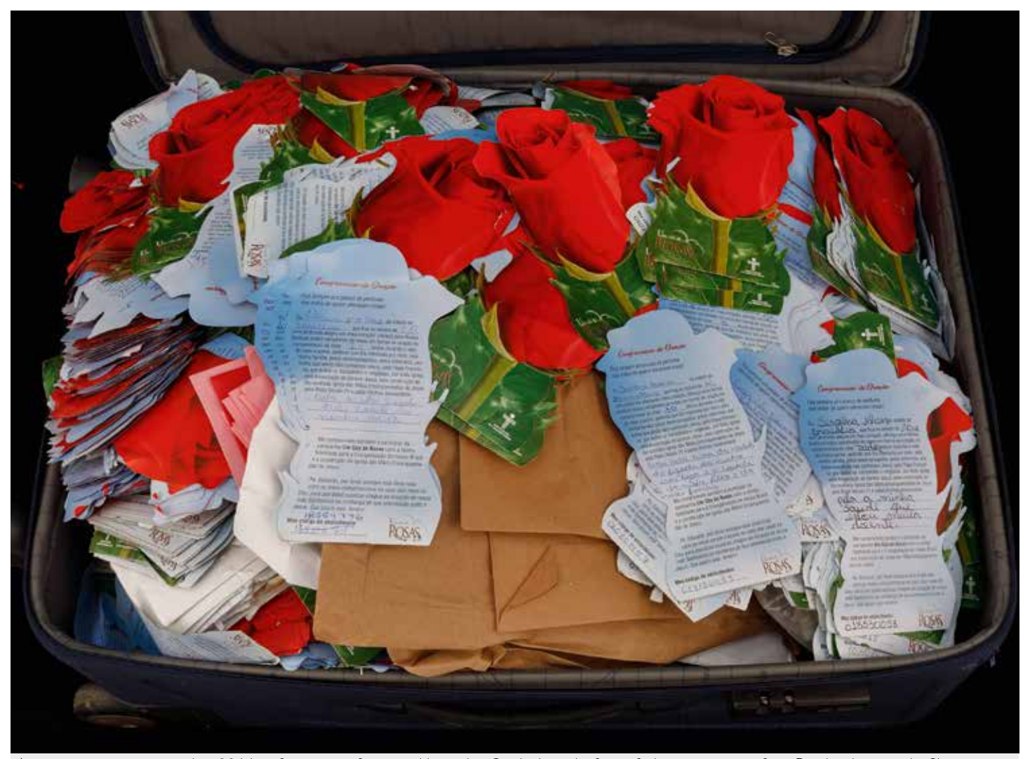
A suitcase containing more than 20 kilos of messages of prayer addressed to Our Lady, in the form of a bouquet, coming from Brazil and sent to the Shrine

The Shrine of Our Lady of the Rosary of Fatima, in Sumaré, began to be built in 1932. That year, the first mass was celebrated in a temporary chapel. The first stone for the construction of the current building was blessed on May 13, 1935. The parish was erected in 1940 and its first priest was Friar Ignatius Gau.