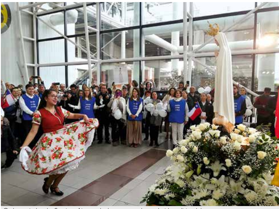
On her arrival at the Santiago Airport, the Image was welcomed with traditional dances

"The Christians of Chile are very aware of the importance of Mary in the history of salvation. It is not possible to understand the Evangelisation of America and its religiosity without the Virgin Mary, and it is beautiful to meet this multitude of faithful, moved by love and the Holy Spirit, wel-