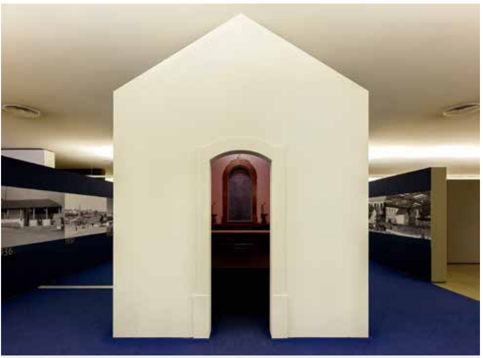
Through the replica the visitors are symbolically stepping in the Little Chapel

It should be remembered that this exhibition was associated with a cultural and scientific program that sought to: "Address very important themes for the Shrine of Fatima and for the religious culture, especially based on the thematic visits that took place on the