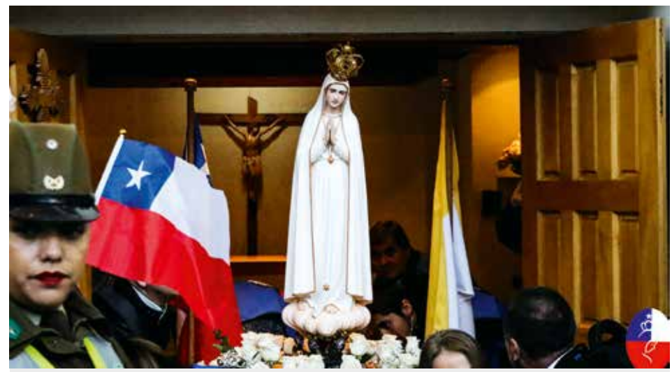
Her last pilgrimage to Chile dates back to 1954-55

According to the records of the Shrine of Fatima, this is the second pilgrimage of the Pilgrim Virgin to Chile; the other took place between June 1954 and December 1955, when the Image made a tour of several South American countries.