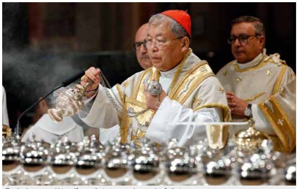
Cardinal presented himself as a pilgrim among thousands of pilgrims

Cardinal of Seoul presided the October pilgrimage and recalled the "miracle of the sun" as a symbol of the "fight against evil"