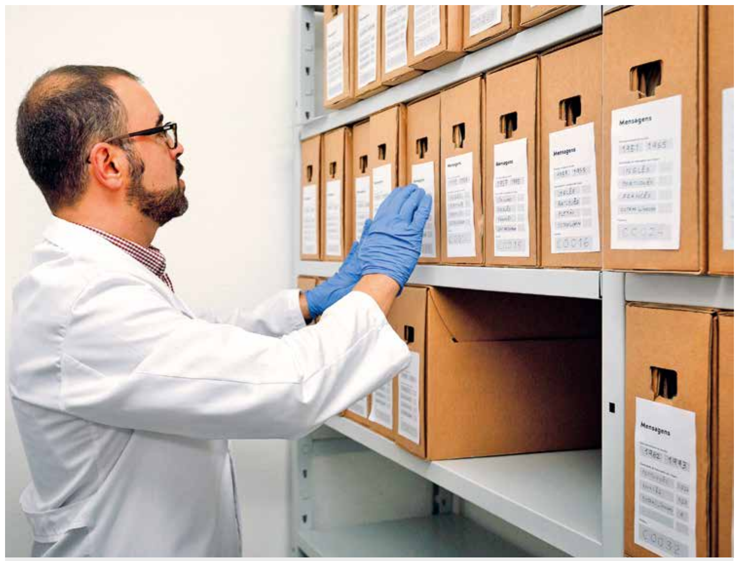
Collected messages are carefully archived by the Oblate Sisters of the Virgin Mary of Fatima

On the fourth thematic visit to the exhibition "Capela-Múndi", the coordinator of the Archives and Library Service of the Department of Studies of the Shrine of Fatima spoke about this "very rich documentary series"