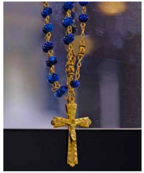
The daily prayer of the Rosary is one of the requests to which the Holy Shepherds said yes

The exhortation was presented at the time as a renewed "call" to holiness, a radi-