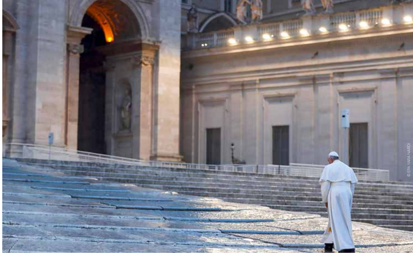
On 27 March, in the middle of Lent, Francis also recalled "the bishop dressed in white" and the memory of Lucia about the Third Apparition