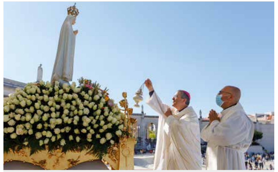
The International Anniversary Pilgrimage of August incorporated, for the 48th time, the National Migrant and Refugee Pilgrimage

"All the men and women who were like sheep without a shepherd are, today, these millions of poor people around the world: the millions of refugees who have to flee, like Jesus, in order to live a proper life; the migrants who, because they do not know the legal ways to emigrate, are exploited by smugglers and traffickers; the millions of people forcibly displaced within their own country for lack of security; all of them have the right to seat at the wedding feast", he said.