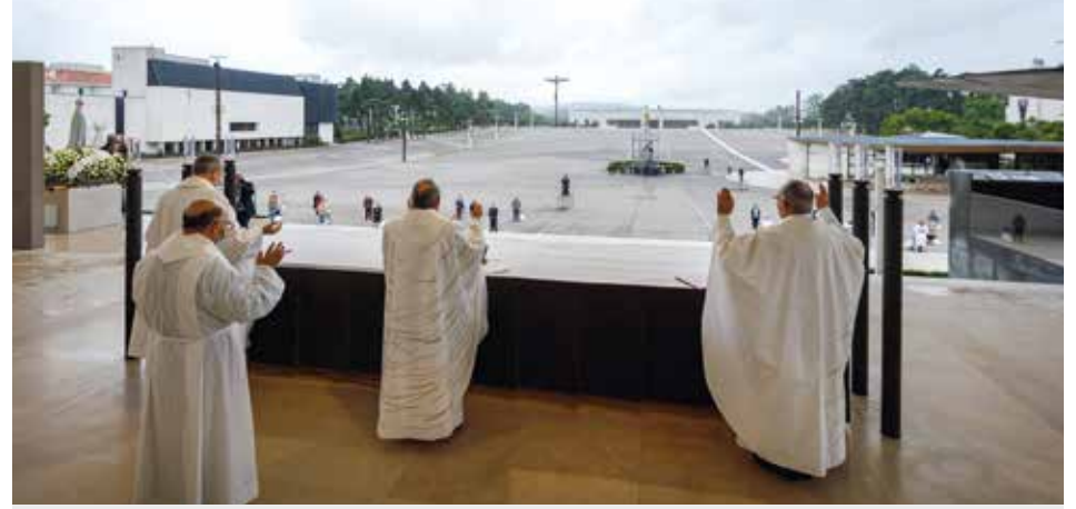
In 2020, for the first time in its history, the Shrine of Fatima experienced an International Anniversary Pilgrimage without the presence of pilgrims

Decrease in the number of pilgrims present in Cova da Iria leads the Shrine to reinvent itself in its way of bringing Fatima to the world / Carmo Rodeia