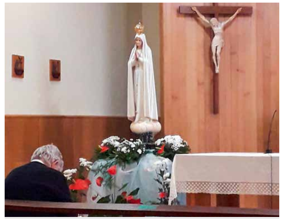
Many collective celebrations and many moments of individual prayer were intensely experienced

In order to respond to the immense number of requests coming from all over the world, several replicas of the first Pilgrim Image were manufactured, totalling thirteen.