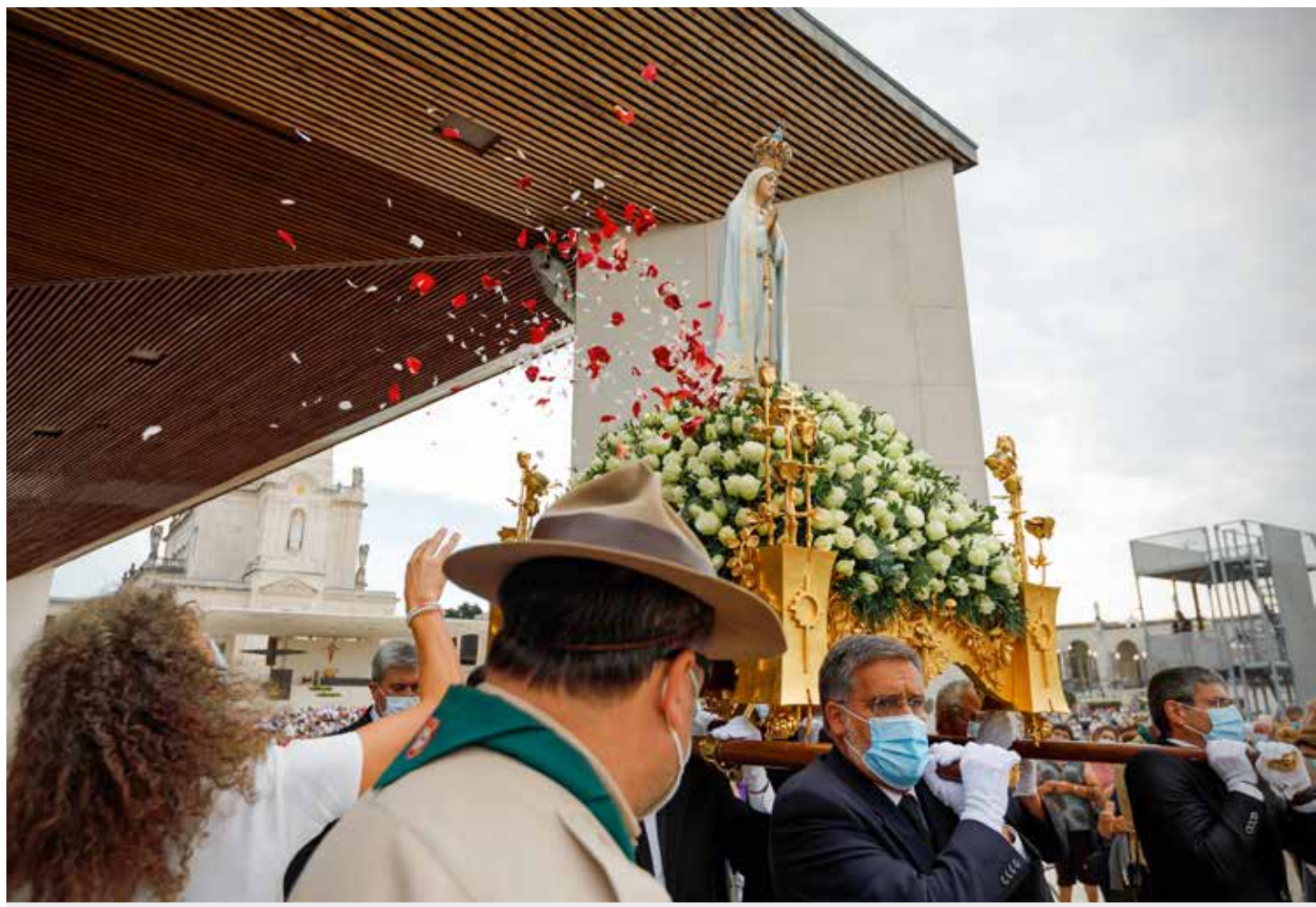
Nine national groups were announced for this pilgrimage, one from France, four from Spain, two from Italy and one from Poland

Celebration of 13 September gathered the largest crowd of the year in Cova da Iria