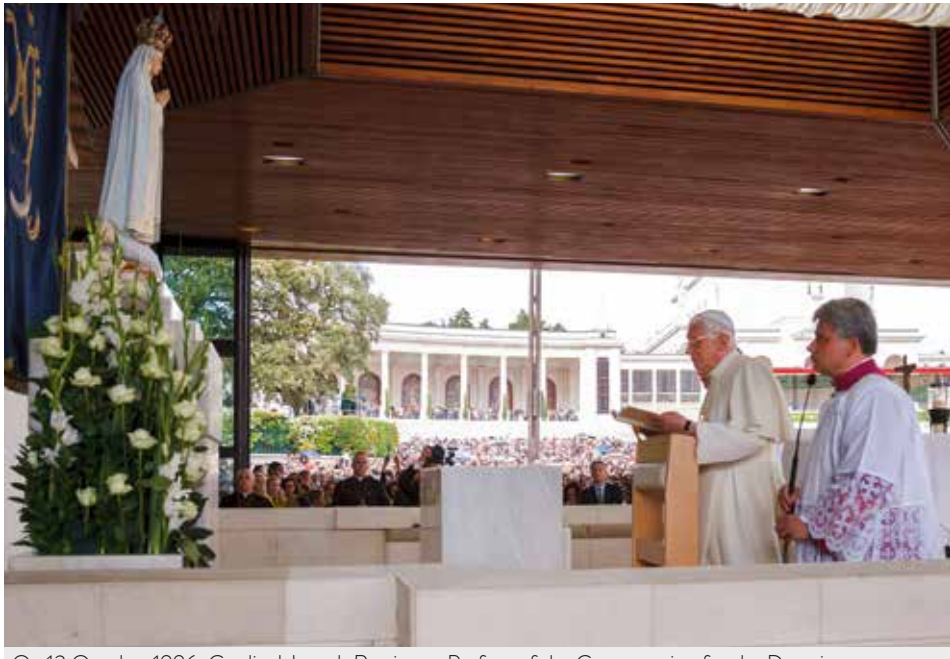
On 13 October 1996, Cardinal Joseph Ratzinger, Prefect of the Congregation for the Doctrine of the Faith and future Pope Benedict XVI, presided over the anniversary pilgrimage of October

The Secret of Fatima is at the heart of the message of Fatima and refers to the visions and words witnessed by the Little Shepherds on the apparition of Our Lady on July 13, 1917, about which she asked them to be reserved, asking them not to disclose them to anyone.