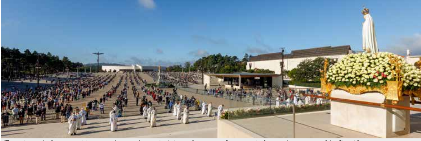
"To emphasize the feminine and the maternal is not only to seek a balance of powers or influences in the functional organization of the Church".

More than 50 priests, 9 of whom were bishops, concelebrated this pilgrimage. In the press room 132 professionals from 39 media were accredited.