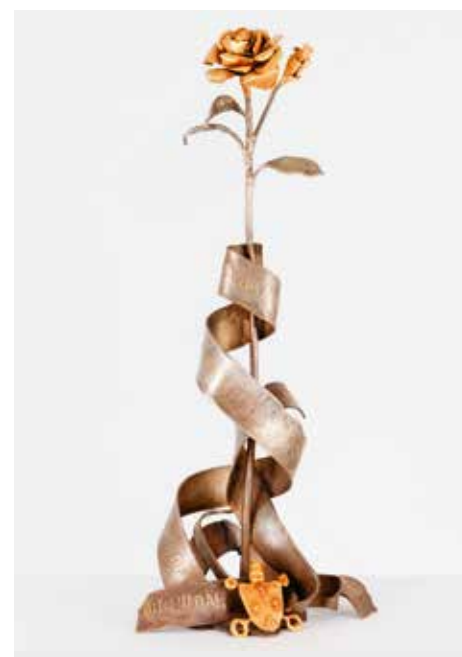
Rose offered by Pope Paul VI

Paul VI inaugurated a tradition of distinction for the Shrine that was to be followed by Benedict XVI in 2010 and by Francis in 2017. The offering of the Golden Rose is a sign of the recognition of fidelity to the Church of Christ and its Vicar. / carmo Rodeia