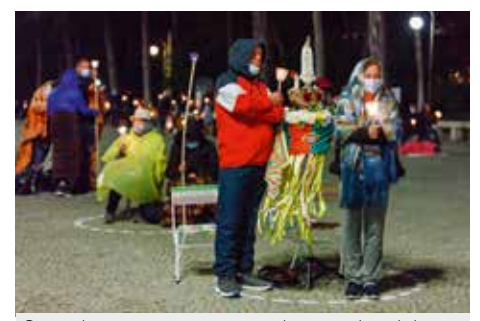
Several groups were present who completed their pilgrimage on foot

"The Lady's message is the bearer of divine blessings for this world of ours", added the Cardinal who challenged the pilgrims to be the messengers "of compassion, tenderness, affection and