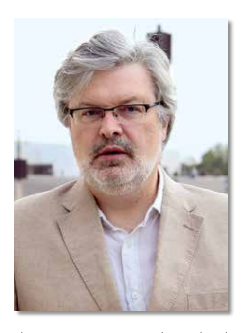
sion Veni, Veni Emmanuel , premiered in 1992, has been performed and presented over 200 times.

The London Symphony Orchestra, the New York Philharmonic, the Los Angeles Philharmonic and the Cleveland Orchestra had interpreted his music, and the concerto for percus-