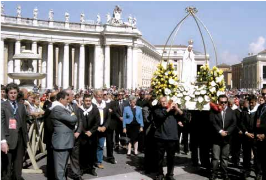
St. Peter's Square, May 13, 2007

Another peregrination of the Pilgrim Statue of Our Lady through Italy is planned for 2008.