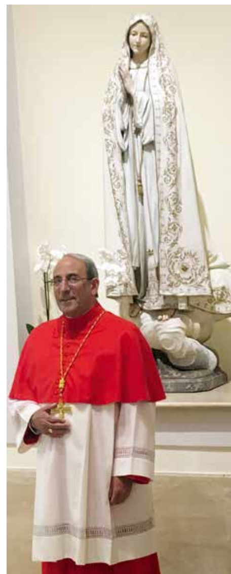
Prelate of Leiria-Fatima assures simplicity

“I really wouldn’t like the expectations to be high. I am part of the Conference of Bishops, which has a president and where each Bishop has a voice, and we work the problems of the Church in Portugal together”, he concluded.