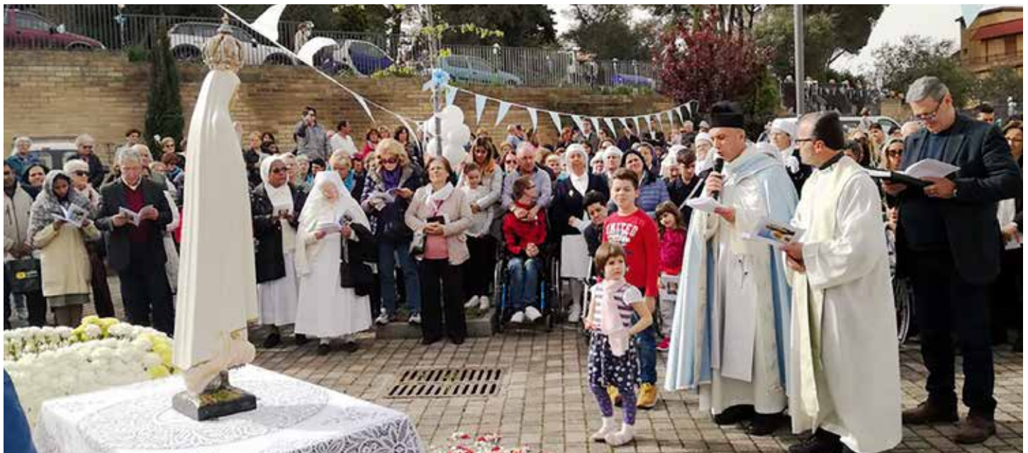
Pilgrim Virgin continues journey in Italy