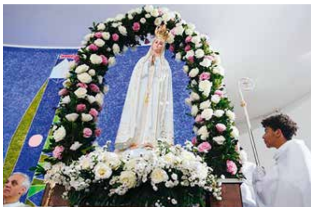
Statue of Our Lady of the Rosary of Fatima is one of the most venerated by the Brazilian Catholics