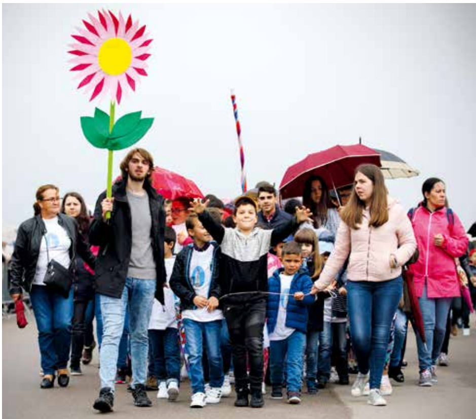
A letter to Our Lady, a challenge posed by the Shrine to the little ones

To follow that idea the present this year to the children was a letter, addressed to each one of them, with a cardboard oratory inside. The oratory reproduces the Chapel of the Apparitions and by opening it, the representation of the statue of Our Lady and the official representation of Francisco