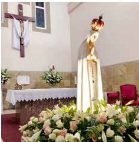
The statue of Our Lady of Fatima before the beginning of the pilgrimage