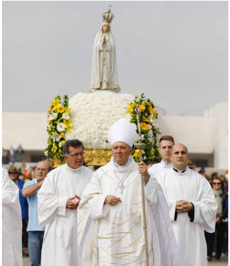
Bishop emeritus of Santarém enhanced the importance of the Message of Fatima in present day

“God had crowned the life of Our Lady with grace and mercy, which are source of hope of being accompanied and protected by Her maternal love. That is what happened in the Wedding at Cana and in Fatima... This is now, today, with those who believe in Him and follow Him, like Mary, His Mother”.