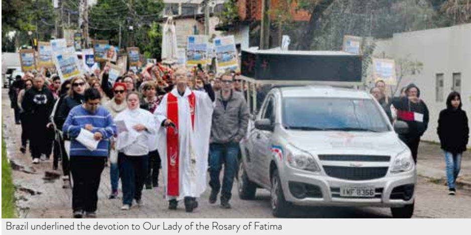
Brazil underlined the devotion to Our Lady of the Rosary of Fatima

The schools of the municipalities and public, that belong to the student parish, had the joy to receive the Pilgrim Statue