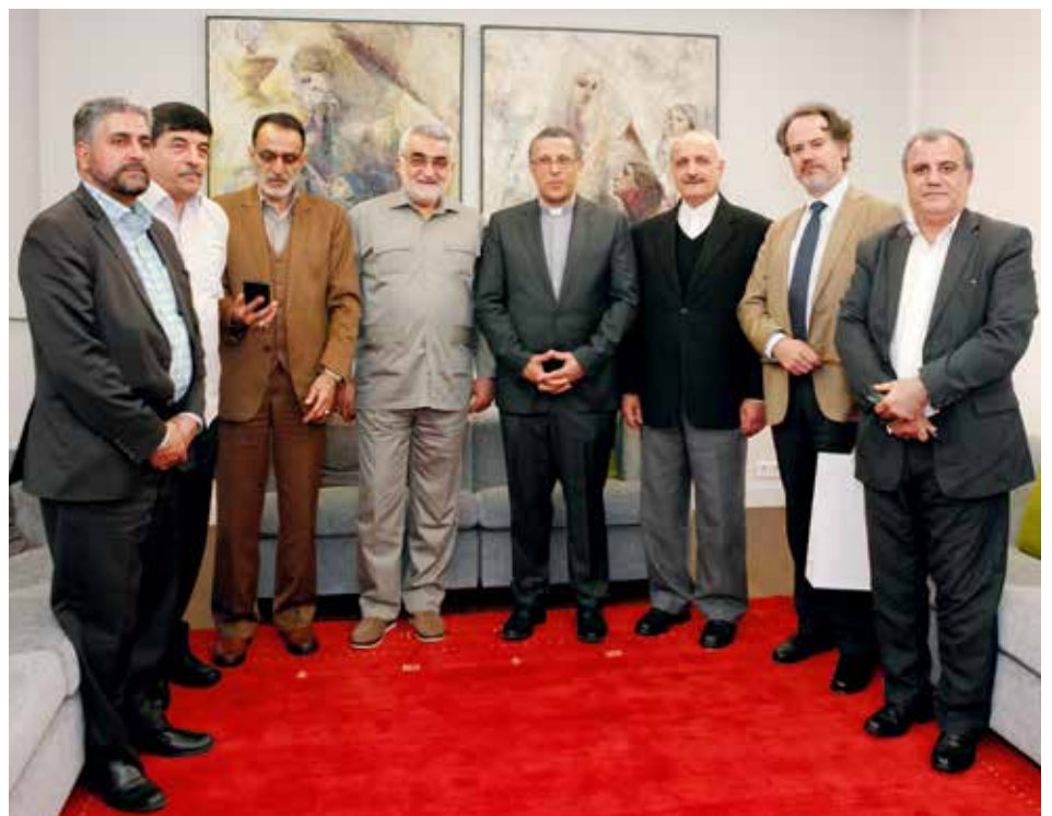
Parliamentary delegation in Fatima to visit the Shrine

The Vice-Rector also underlined the “kind relation” the Shrine has with Eastern countries “because of the history of the events and the Message of Fatima”, especially with the Ukrainian community, one of the first immigrants community in the country “with which strong bonds were tied”. Two Ukrainian priests assist the Shrine of Fatima to welcome, in a permanent way, this community, who visit very often Cova da Iria.