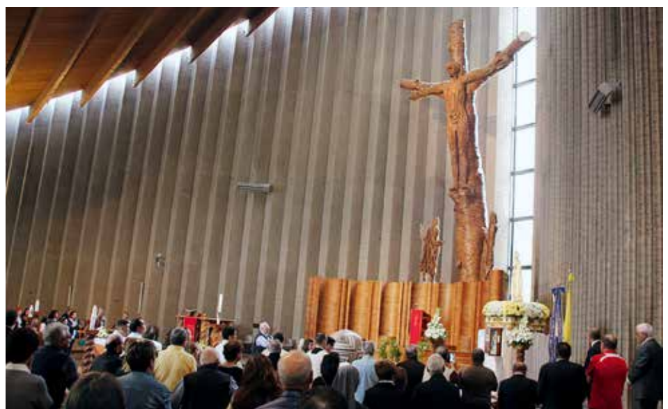
Italians prayed for peace in front of the Pilgrim Statue

The fruits of grace conceded by the Lord