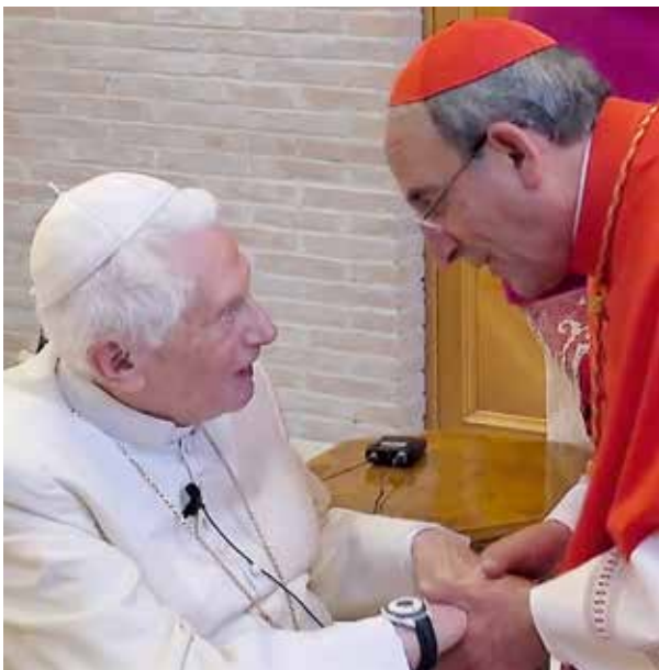
New Cardinals greeted Pope Emeritus Benedict XVI