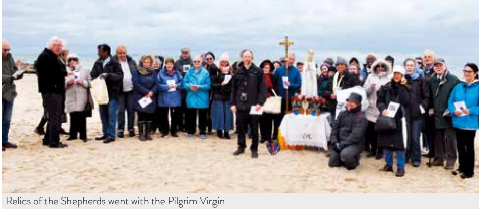
Relics of the Shepherds went with the Pilgrim Virgin

Approximately 45,000 joined in this historic witness of faith