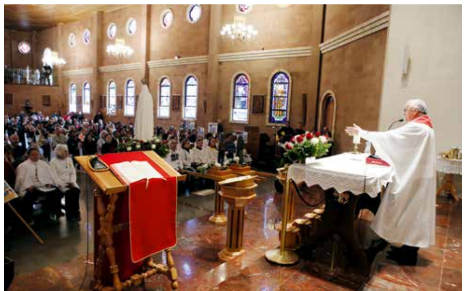
Marian celebration in Porto Alegre, Brazil

In the month dedicated to Mary, our Mother, Our Lady of Fatima, numerous graces have been received and the joys are uncountable, strength and faith renewed in each one who entered this Shrine. Renewed by the love of Christ and by the protection of the Mother of Fatima, laypeople assume the mission of being salt of the earth and light of the world.