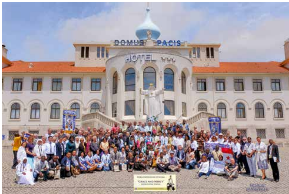
Pastoral testimony of each participant is important in this initiative