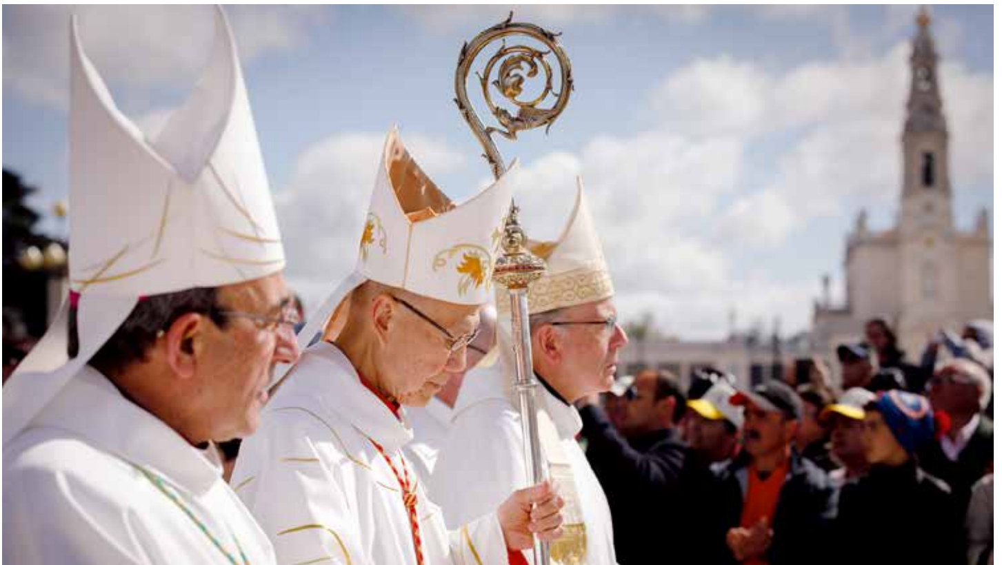
Bishop emeritus of Hong Kong was the first Asian to preside over an Anniversary Pilgrimage in Fatima

“Blessed Virgin of Fatima, turn your gaze upon us, upon our families, our country, and the world”.