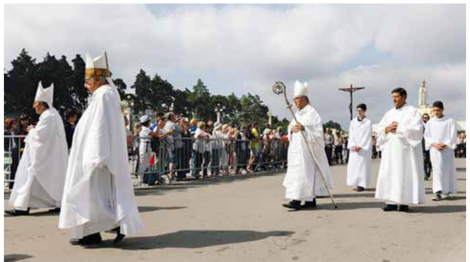
Auxiliary Bishop appealed to the need of “wise and competent leaders” in today’s world

“The pilgrimage is a holy journey, a spiritual experience of prayer, of inner silence, of search of the light and truth, of purity of heart, of reconciliation, of conversion and the peace within us, with God and the others”.