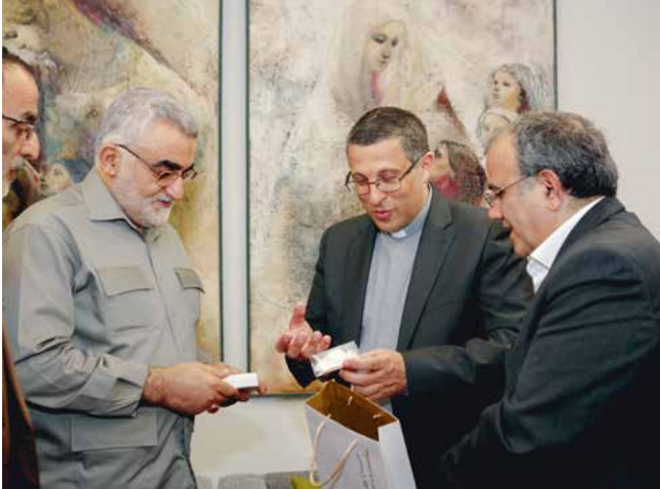
As pilgrims for peace, Iranians underlined the esteem for Our Lady

F. Vitor Coutinho underlines common motivation between the two religions for the construction of Peace