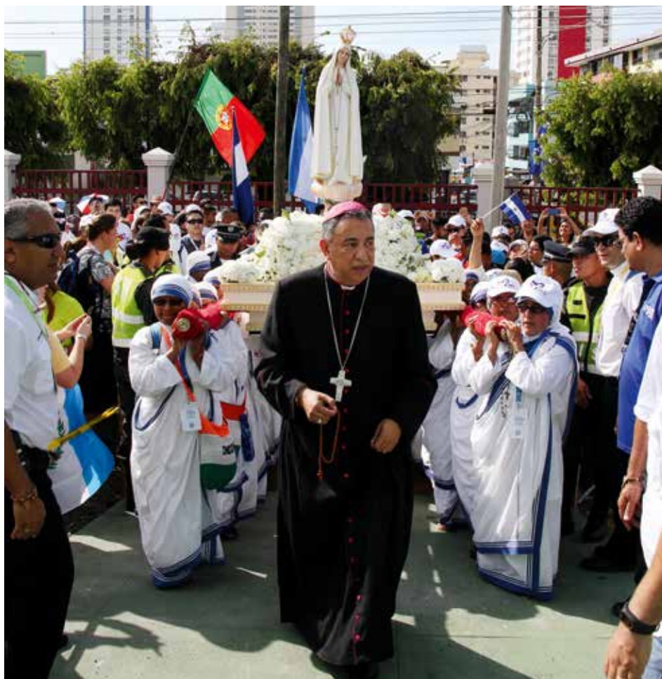
The Pilgrim Virgin Statue travelled the peripheries of Panama City

The best strategy for organizing such an event is to place it in the hands of God and ask for the intercession of Mary. We have to do everything that is possible from the human point of view, but it is the providence that protects us. That is why we