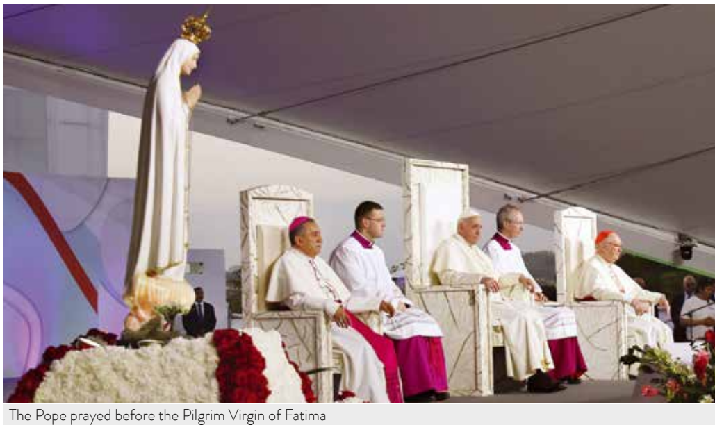
The Pope prayed before the Pilgrim Virgin of Fatima