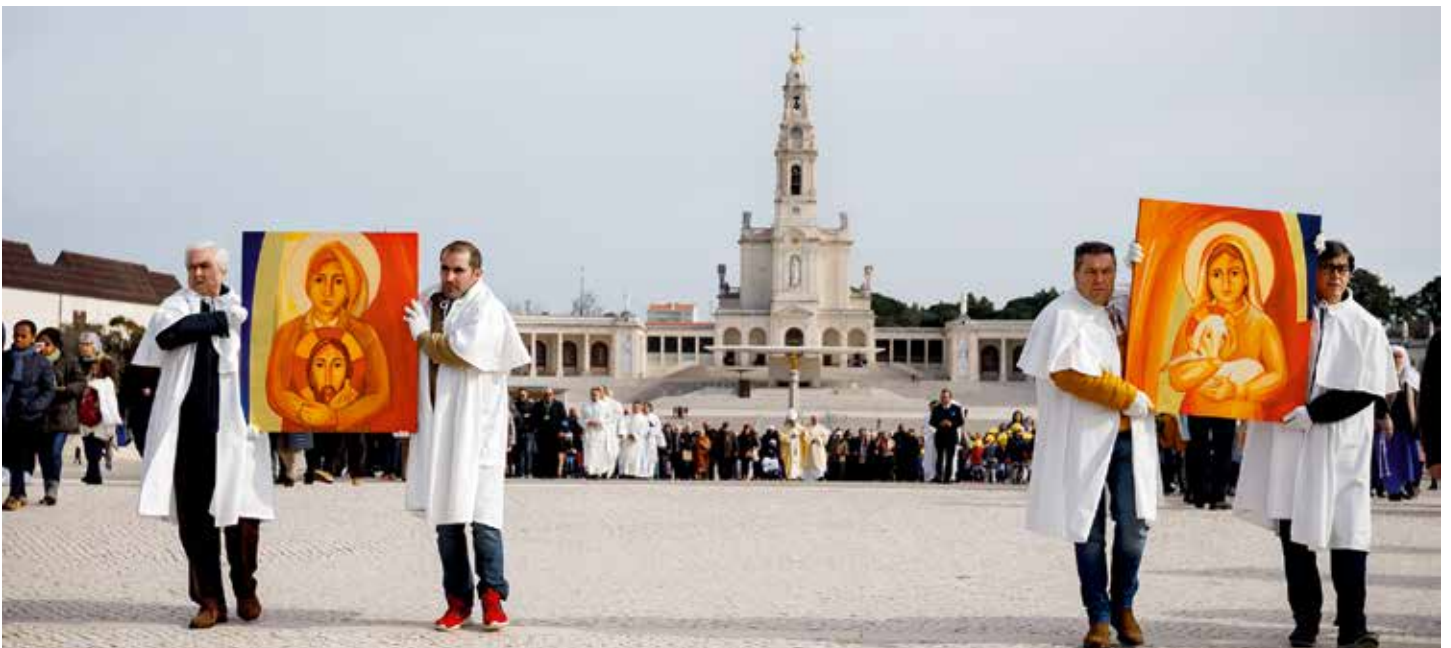
Fatima and Brazil celebrate on the same day the memory of the Saints Shepherds