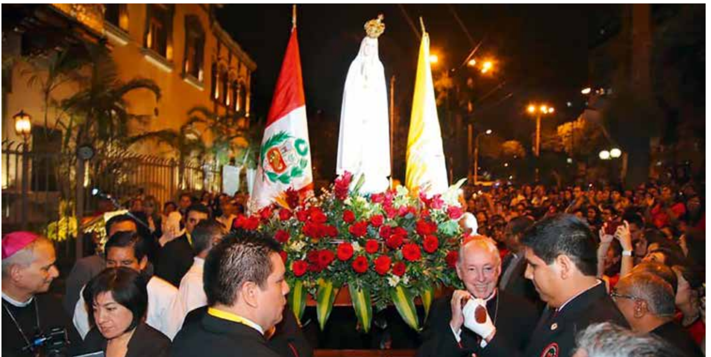
“We have no words to describe the experience of love we’ve lived before the Blessed Virgin Mary”

“I was deeply impressed when reading about these three children. After they had seen all that the Virgin showed them, they did so much to save souls! So, I ask myself: what will be our mission? What does she call us to do?”, she points out, recalling that today “it’s clear that everything that happened in Colombia was through the intercession of Our Lady”.