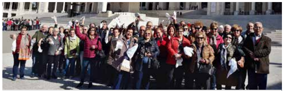
Spanish pilgrims are still the most numerous in Cova da Iria

We give infinite thanks to Our Lady for allowing us, once again, to visit her and show her our filial and faithful love.