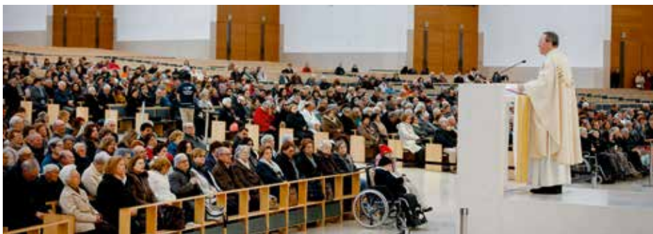
Sicks participated festively in the pilgrimage of March

Focusing on the call for conversion which is part of the Message of Fatima, the president of the celebration referred to the commitment assumed by Saint Francisco