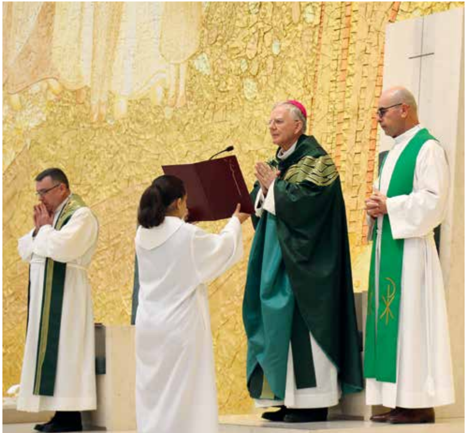
Polish bishop spoke about the example of Mary for today's world

“Her monthly manifestations to the three Little Shepherds, the promises to take them to Heaven and, above all, her fervent requests and appeals, show how Our Lady of the Rosary dwells on each Man with her motherly love, aiming at his salvation”, he concluded.