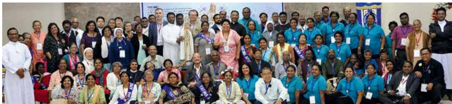
World Apostolate of Fatima towards Asia

The World Apostolate of Fatima is established in India for many decades and this historic Asian Congress showed the vitality of the Fatima movement in the country and opened new horizons on the Message of Fatima, its theology and spirituality, for the benefit of the local Church and the whole region of Asia.