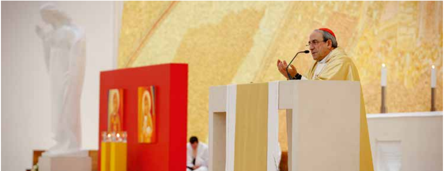
Antonio Marto presented in an emotional way the example of Saint Francisco and Saint Jacinta Marto to humanity

Shrine of Fatima will mark the centennial of the death of St. Francisco Marto