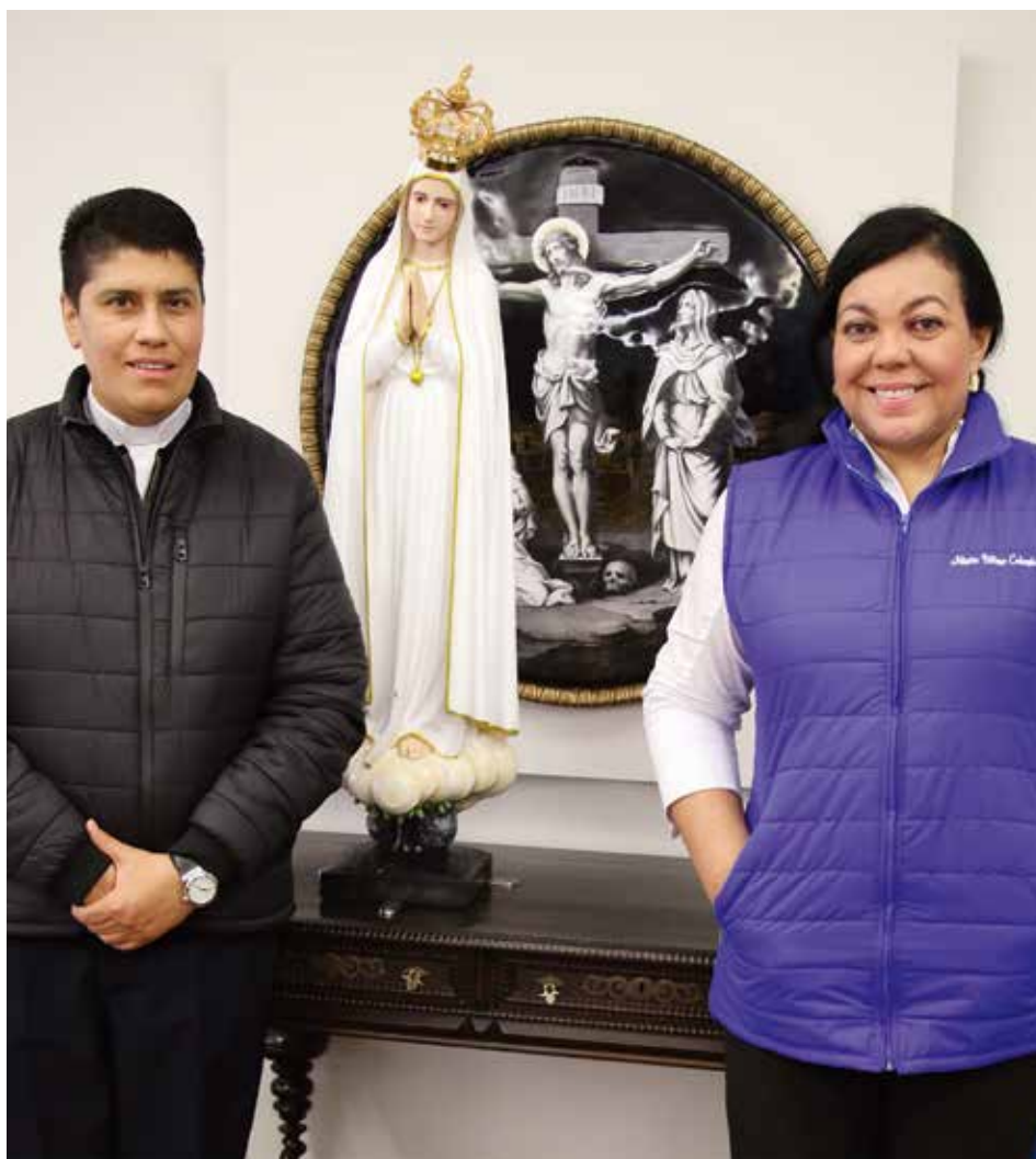
Promoters of the Pilgrimage brought the "Mother" back home