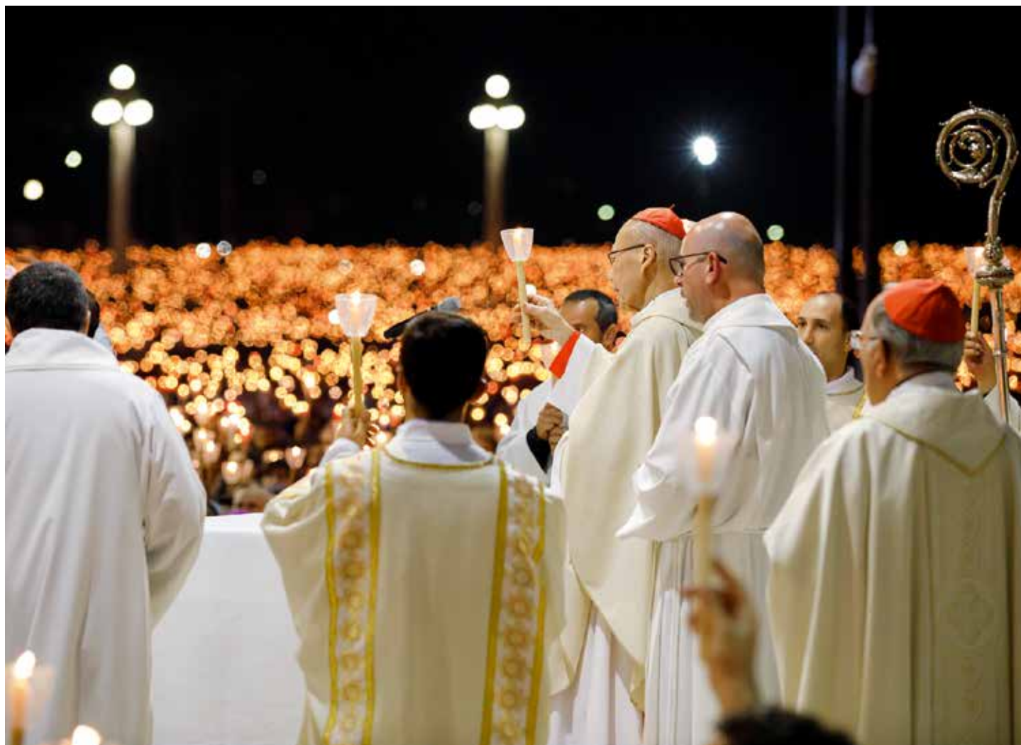
The Shrine of Fatima turned towards the Asian Continent

The main celebrants of the pilgrimages of 2019 are already known / Cátia Filipe