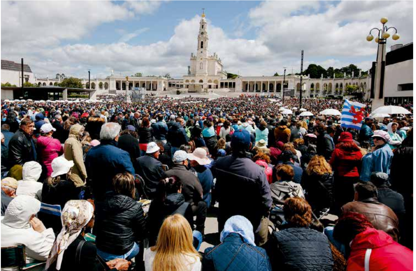
During the first year after the Centennial, Fatima confirmed as “Altar of the World”