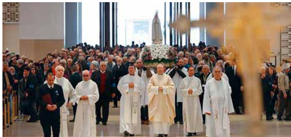
Conversion was the core of the pilgrimage of April in the Shrine