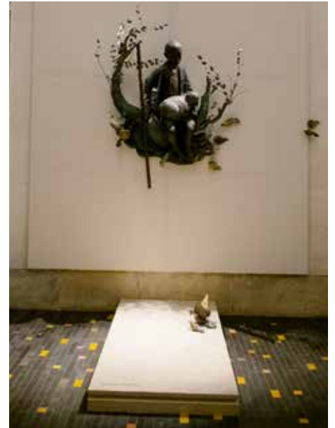
Veneration of tomb marked the celebration

During this year, in the house of Francisco, in the village of Aljustrel, where he was born, a