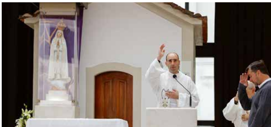
Departure of the Pilgrim Statue of Fatima marked by prayer for Peace and for the Holy Father

The program of this journey includes a visit to 26 dioceses over a year