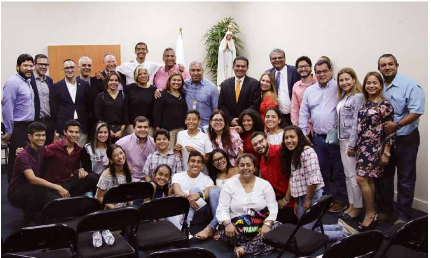
World Apostolate of Fatima in Panama organized the visit of the Pilgrim Statue of Fatima