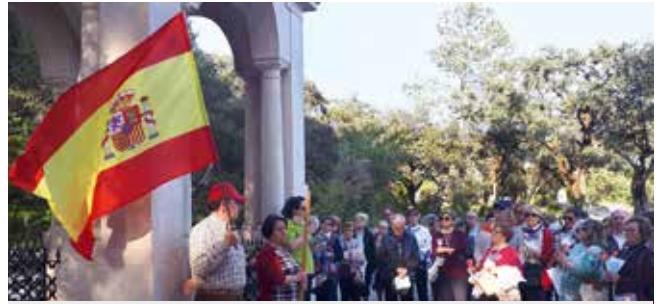
Spanish pilgrims celebrate in Valinhos

We were also entrusted with the prayer of