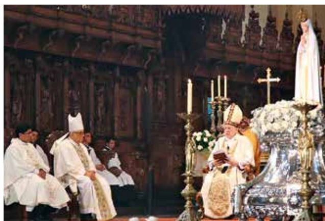
Bishops of Peru consecrate to Our Lady

On Sunday, the 20th of January, the Statue's last day in the country, a celebration presided by the Cardinal Juan Luis Cipriani Thorne took place in the Cathedral of Lima, where several ecclesial