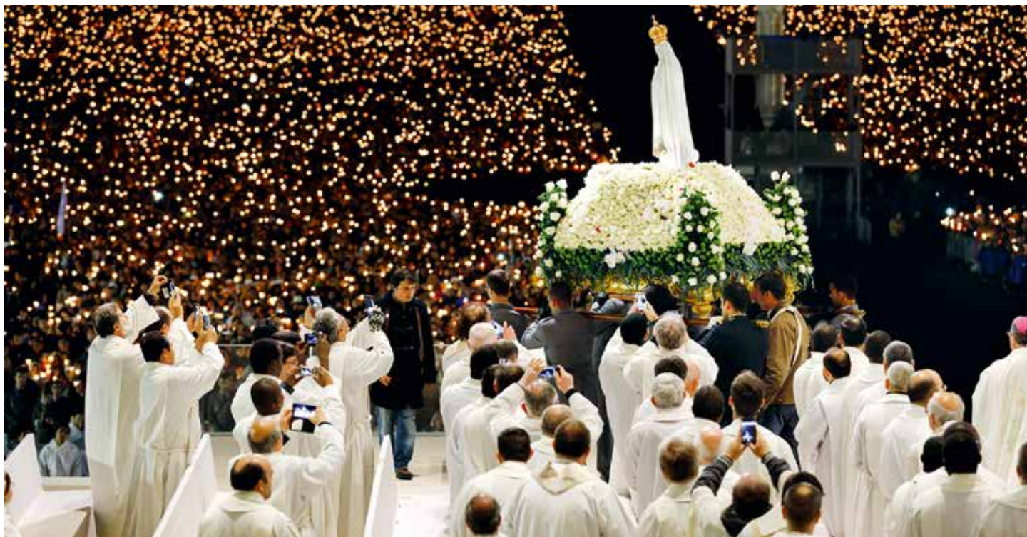
The candlelight procession is one of the most touching moment of the celebration of the Shrine

The Shrine remains one of the most sought-after site by Christians. Nine out of the ten countries that concentrate more than 55 % of the Catholics of the world go on pilgrimage to Cova da Iria every year.