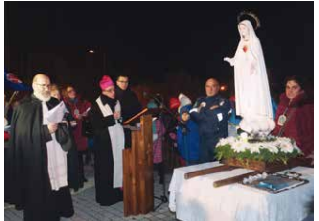
The region maintains a very strong link to the Message of Fatima

The municipality chose a small square just at the entrance of the city and gave it the name of "Oasis of Our Lady of Fatima", and on the same square was enthroned the image brought from the Shrine of Fatima and blessed in the Chapel of the Apparitions.