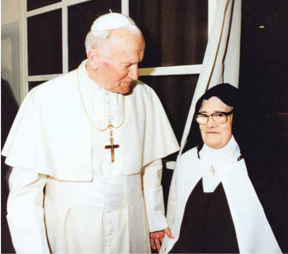
Sister Lúcia met John Paul II when he visited Portugal