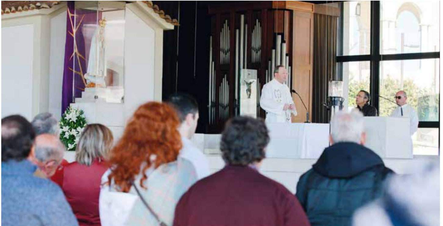
A day of prayer was called for by Pope Francis on February 4

This initiative was called for by the Holy Father, the Pope Francis