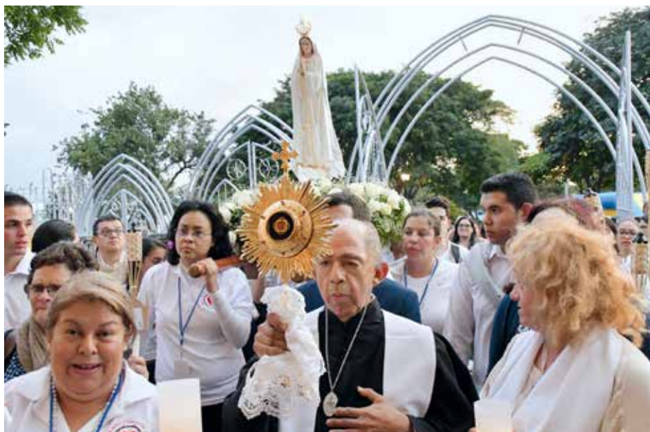
The relics of the Little Shepherds worshipped in Costa Rica

The lives of Francisco and Jacinta were definitely altered in the light of this Message of Mercy. Francisco took on a life of contemplation, committed to the consolation of God, who appeared “so sad” to him. The Blessed Virgin recommended him to say many Rosaries. And Francisco said a lot, seeking the loneliness of the hill or the company of Jesus hidden in the tabernacle of his parish church, in order to “think about God”. Jacinta got impressed by the pain of the sinners and prayed and sacrificed herself for their conversion, for the peace in the world, and for the Holy Father: “I am in a lot of pain, but I offer it all for the conversion of the sinners and for the reparation of the Immaculate Heart of