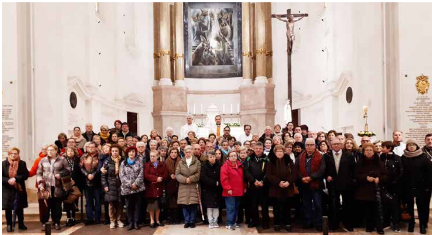
The Sunday Eucharist was celebrated in the Basilica of Our Lady of the Rosary

The pilgrimage took place between the 12 th and the 15 th of April