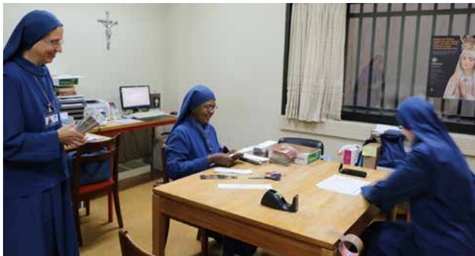
Oblate Sisters collect and sort the letters that come with the prayer requests

Messages that tell the story of Fatima and of the world