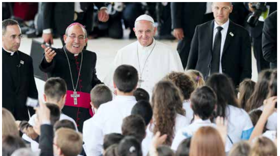
Simplicity and proximity are the main characteristics of Pope Francis

In the speeches he gave in Fatima, Francis called for peace and harmony and recalled those who are excluded from the society as