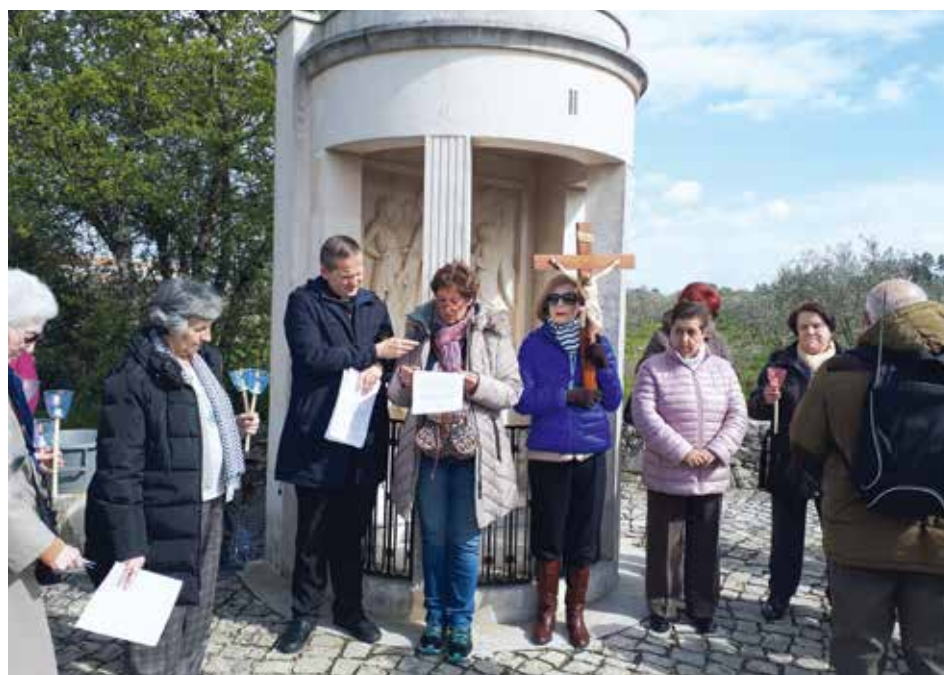
The Via Sacra was a subject of meditation on the Path of the Little Shepherds

On our way back home, the testimonies of the pilgrims who had joined us revealed that all of them were full of love for the Blessed Virgin, filled with spiritual grace and that they were all expecting to return to Fatima in the years to come, should God and Our Lady allow it.