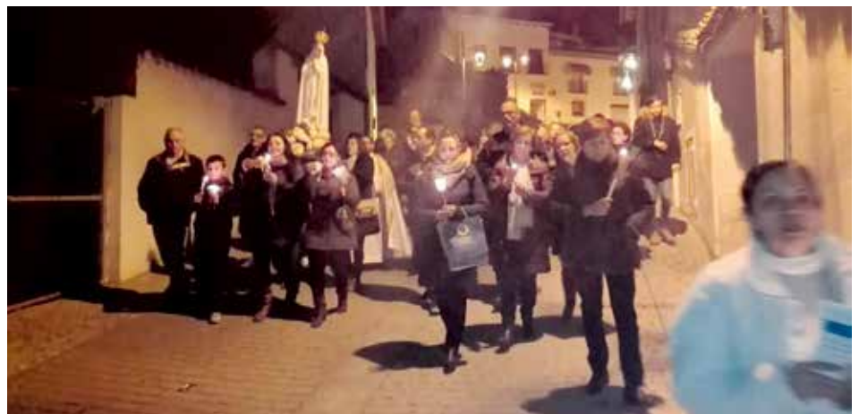
The devotion to the Virgin of Fatima was almost palpable throughout Her visit

our tribulations, supporting our faith and increasing it, healing our hearts, grateful for our prayers, mistress in the knowledge of her Son Jesus Christ, pious and worthy of devotion, such is our Blessed Mother of Fatima, who brings us so many blessings and so much love, and who managed that day to bring together people who simply needed a caress from their mother, so that, among tears of emotion, white tissues and the singing of Her anthem, we could say goodbye to her with pain but also in the hope that she will travel the world, raising the hearts, and that she will come back soon to see us so we could praise her.