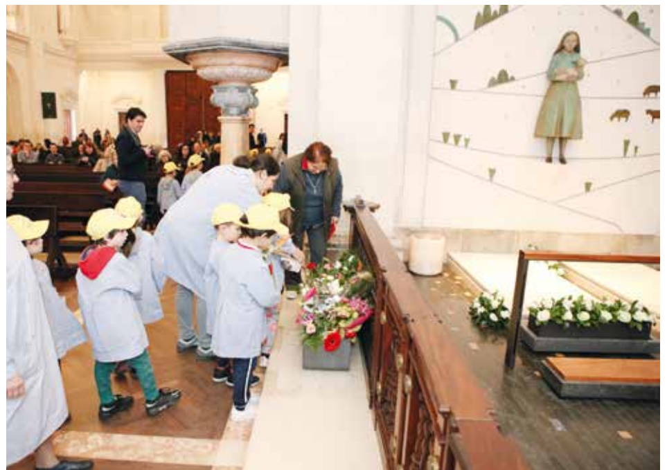
It already became a tradition for the children to give flowers to the Little Shepherds

After that, there was a visit to the graves of the Little Shepherds in the Basilica of Our Lady of the Rosary of Fatima.