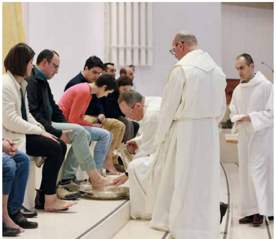
The Mass of the Lord's Supper was attended by the collaborators of the Shrine of Fatima

With Easter started a new celebratory agenda in the Shrine of Fatima, which can be consulted at www.fatima.pt .