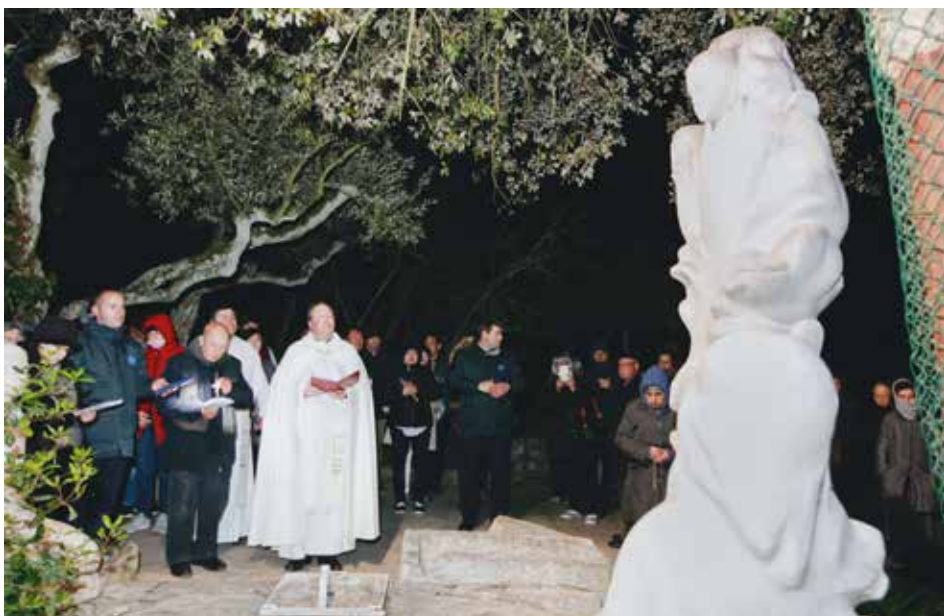
In Poço do Arneiro, the pilgrims recalled the requests that the Angel made to the Little Shepherds

During the 950-meter itinerary, following the path of the little shepherds towards the hill of Valinhos, the pilgrims were invited to listen to the Gospel, which was followed by a short prayer said by the rector of the Shrine and eventually by the Litany of Peace.