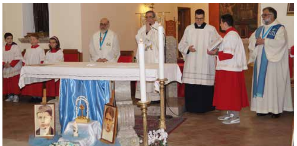
February the 20th was lived through with a deep devotion