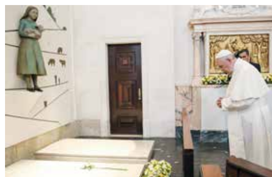
Pope Francis prayed on the tombs on May 13, 2017

"People are moved by their example and, above all, by how they dedicated themselves to God," said Ângela Coelho referring to the Prefect of the Congregation for the Causes of Saints himself, the cardinal Angelo Amato, who always shown how deeply touched he was by this cause; without forgetting the Pope, who still makes fre-