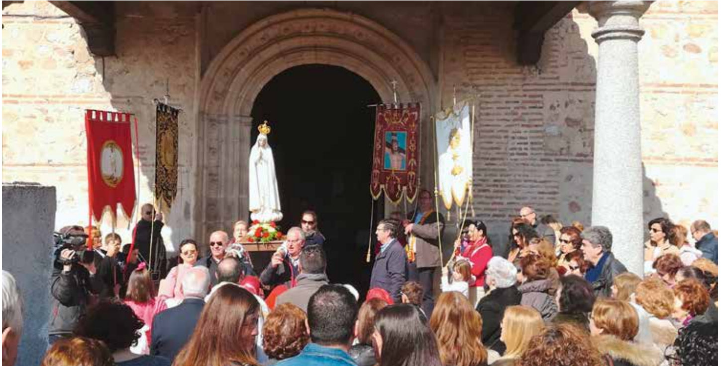
An intense program of prayer had been prepared to receive the Pilgrim Virgin

The visit took place from the 13 th to the 25 th of February in a festive and worshipping atmosphere