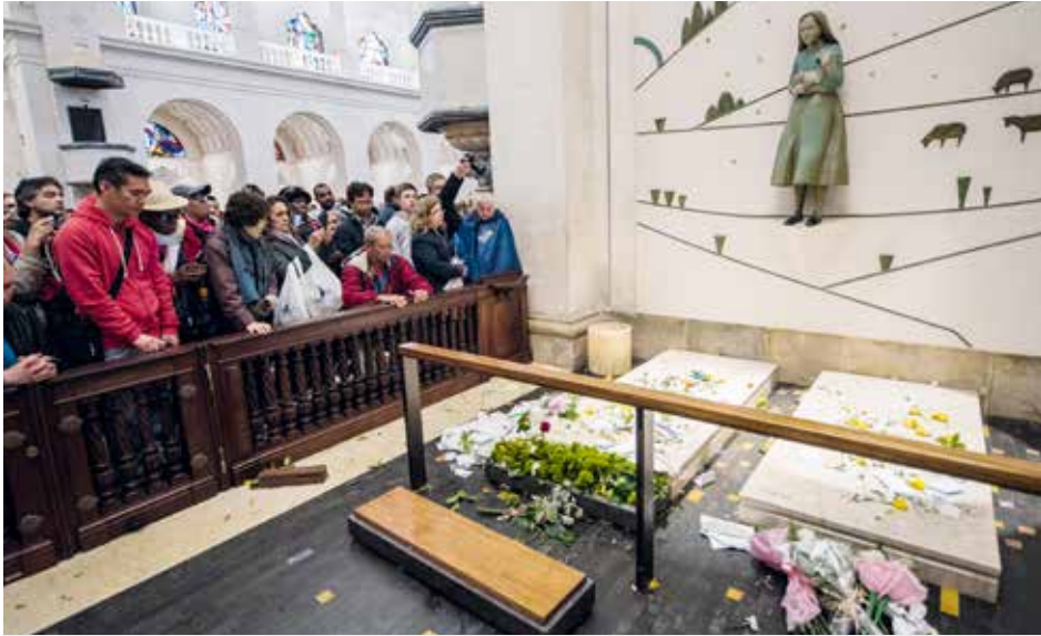
The body of Sister Lúcia is in Fatima since October 19, 2006