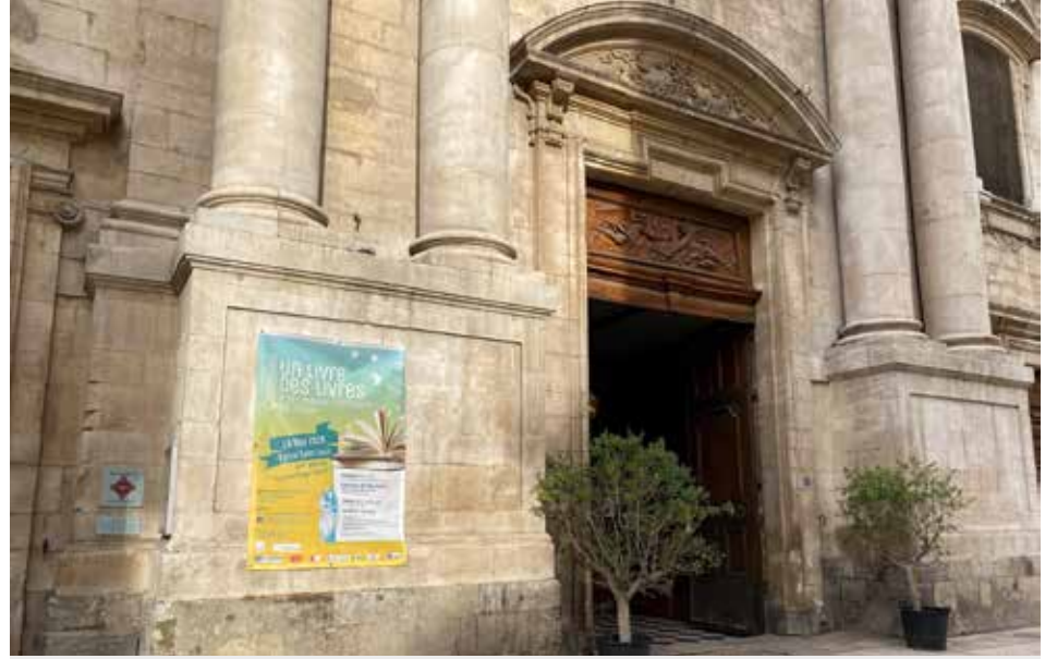
The fourth edition of the Festival in Toulon included a delegation from the Shrine of Fatima

The event's fourth edition took place in Toulon, France / Carmo Rodeia