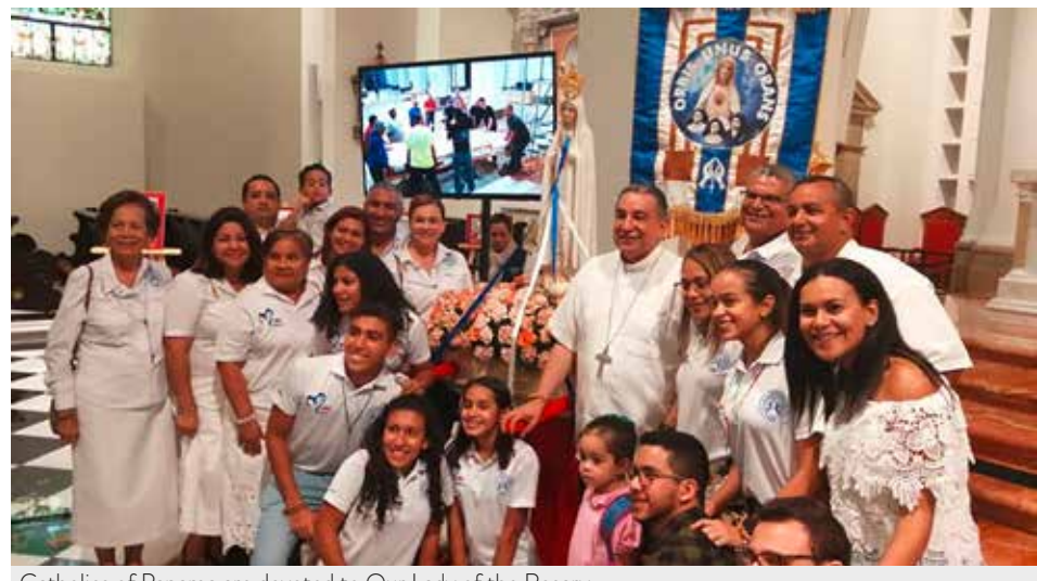
Catholics of Panama are devoted to Our Lady of the Rosary

The World Youth Day – Panama 2019 took place one year ago