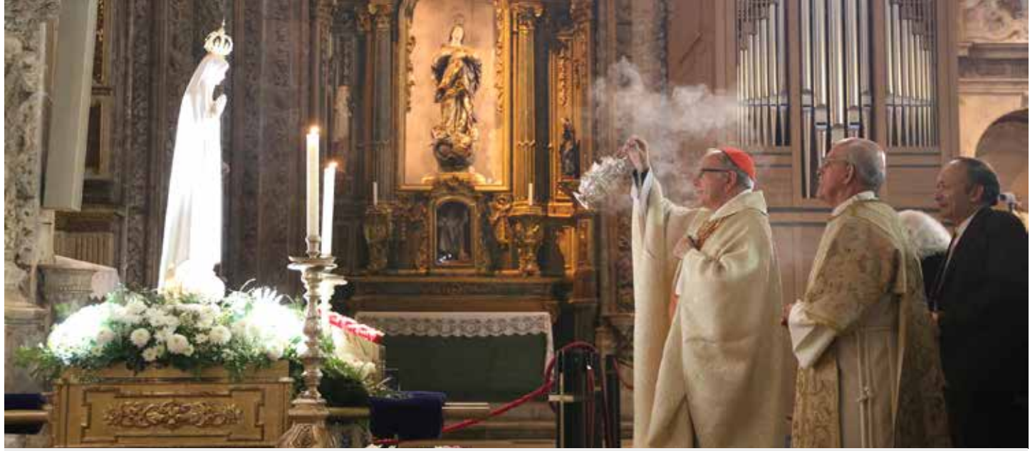
Celebrations helped to spread the Message of Fatima

'Mary, Queen of Missions' was the motto of the visit which lasted from 29th September to 3rd November 2019 / Cátia Filipe c/ Jornal Voz da Verdade