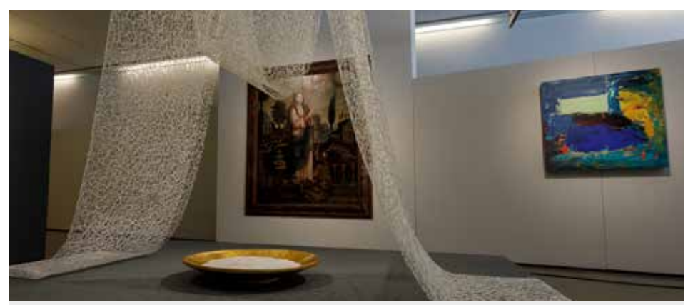
Temporary exhibition proposes a reflection on the iconographic representations of the Virgin Mary

"Dressed in White" is the title of the temporary exhibition at the Shrine celebrating the Centenary of the sculpture of Our Lady of Fatima, venerated at the Little Chapel of the Apparitions. This exhibition proposes a reflection on the relation between art and devotion, considering the most beautiful statues of the Virgin Mary. It will be held at St. Augustine Social Hall, at the lower floor of the Basilica of the Most Holy Trinity, between 9:00 am and 6:00 pm daily, and runs until 15 October 2020.