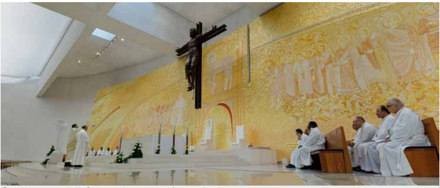
The celebration was marked by Portuguese pilgrimages coming from several parishes

The Church of the Most Holy Trinity was dedicated in 12 October 2007 by Cardinal Tarcísio Bertone, then Secretary of State of the Vatican and papal legate of Pope Benedictus XVI, for the closing of the 90<sup>th</sup> anniversary of the apparitions of Our Lady to the three little shepherd seers.