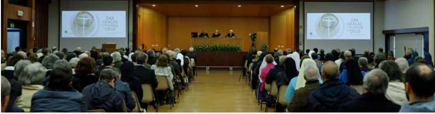
The Pastoral Year theme presentation day took place last November 30

The Pastoral Year Presentation Day, preceded by the opening of the exhibition celebrating the centenary of the first sculpture of Our Lady of Fatima, entitled "Dressed in White", had something new this year: the volunteers of the Shrine of Fatima were invited to assume or renew the Volunteer Compromise, maximum expression of this life in God, in the willingness to help others.