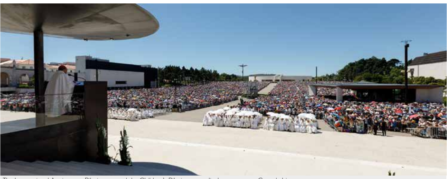
The International Anniversary Pilgrimages and the Children's Pilgrimage are lively moments at Cova da Iria

According to preliminary data of October, in the first nine months of 2019 the Shrine welcomed about 4,5 million pilgrims in 7.658 official and private celebrations. The figures maintain the trend of 2018, with a growth of groups from Asia, with a more effective presence of pilgrims from Africa and the usual presence of pilgrims from Latin America.