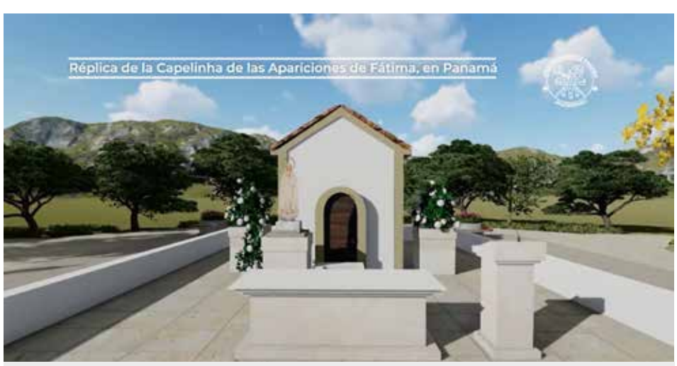
Panama City will have a replica of The Little Chapel of the Apparitions

Insisting on a Marian theme is for the Rector of the Shrine of Fatima "good news" and "a big challenge" and, consequently, the Shrine of Fatima is focused on the youth pastoral having in mind this time frame, consubstantiating the importance of Mary as a role model for young people.