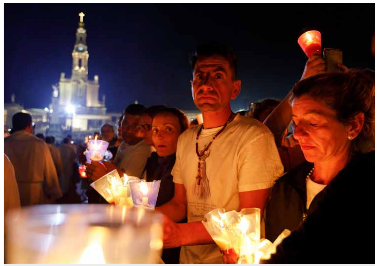
Thousands of pilgrims took part in the Shrine's celebrations; the candlelight procession is always one of the most attended moments

At the end of 2019, we look back at the significant moments of the pastoral year of 2018/19 in the Shrine, where we gave thanks to go on pilgrimage in Church / {\tt Diogo\ Carvalho\ Alves}