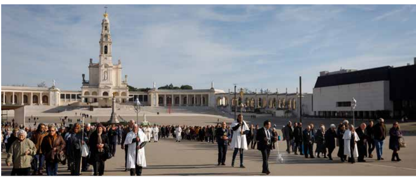
The pilgrims prayed the Rosary and took part in the procession to the Basilica of the Most Holy Trinity

In the votive mass of Our Lady there were several prayer groups, among them Amigos de Maria (Mary's Friends), from the Diocese of Coimbra.