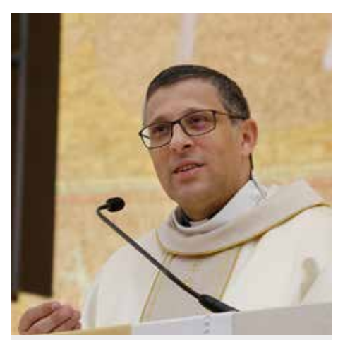
The Vice-Rector warned about "self-indulgence and apathy" in faith

Therefore, "Fatima is an invitation for us to live with a full heart because we are certain to have a place in God's heart. Fatima is a cry against apathy because it