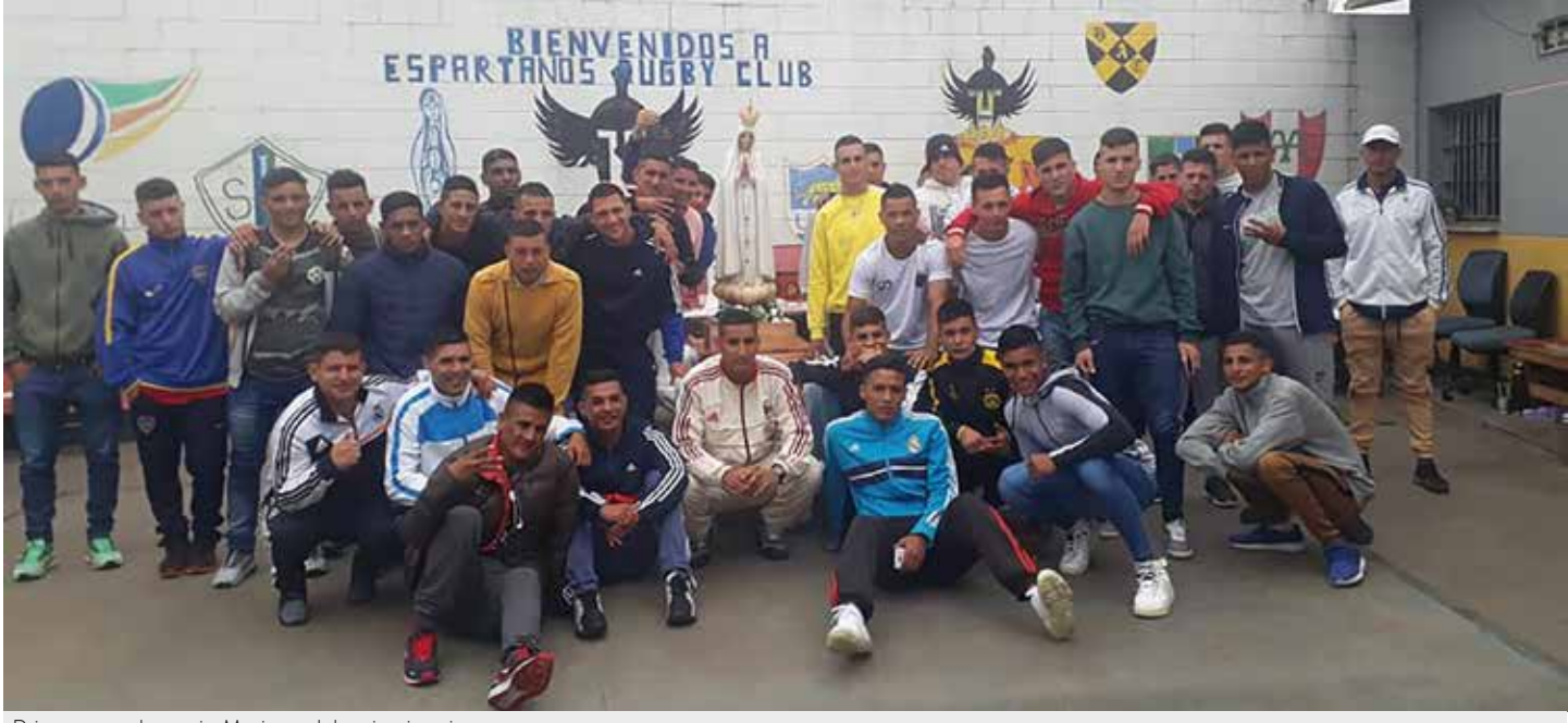
Prisoners took part in Marian celebration in prison

Pilgrim Statue no. 10 is travelling through Argentina