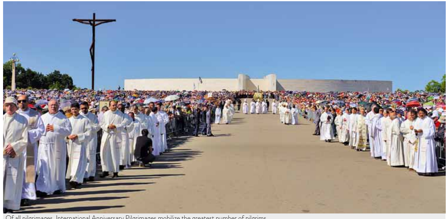
Of all pilgrimages, International Anniversary Pilgrimages mobilize the greatest number of pilgrims

Number of visitors of the Shrine are stabilizing after the Centennial / Carmo Rodeia