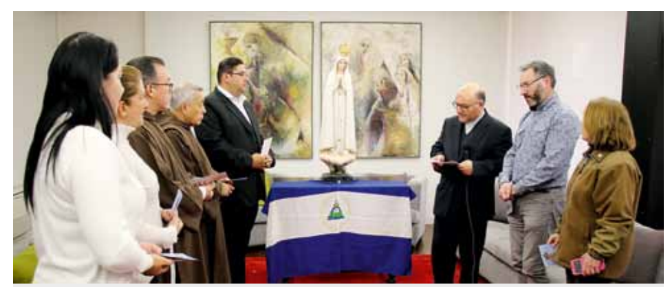
2020 is a Marian Jubilee Year in this Central American country

Image number 6 of the Pilgrim Virgin of Fatima arrived in Nicaragua on January 25 and was received in the Metropolitan Cathedral of Managua