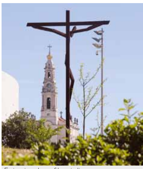
Fatima is a place of hospitality

In 2017, the year of the Centenary of the Apparitions, Fatima hosted the meeting in which about 150 people participated.