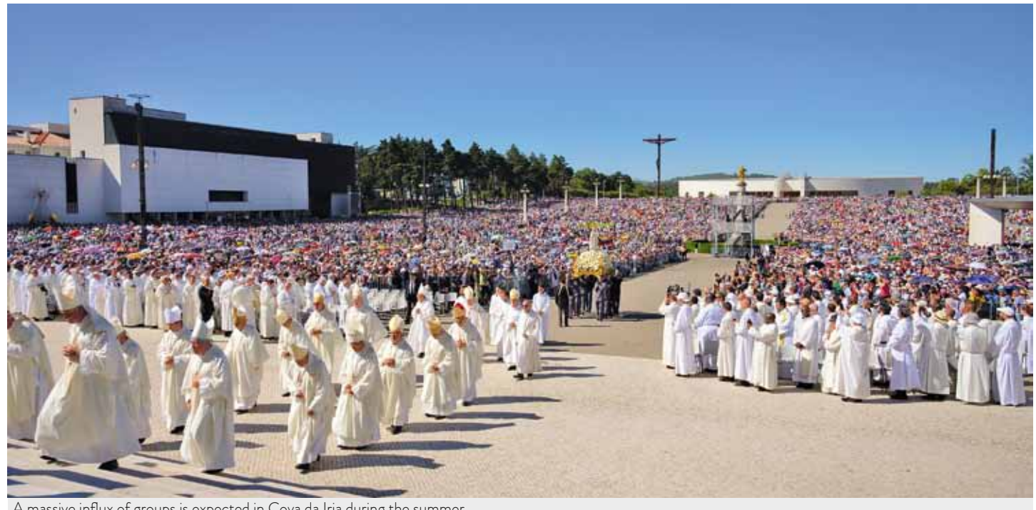
A massive influx of groups is expected in Cova da Iria during the summer

The Shrine is preparing for the international summer pilgrimages, which, for this pastoral year, invite pilgrims to "Give Thanks for Living with God"