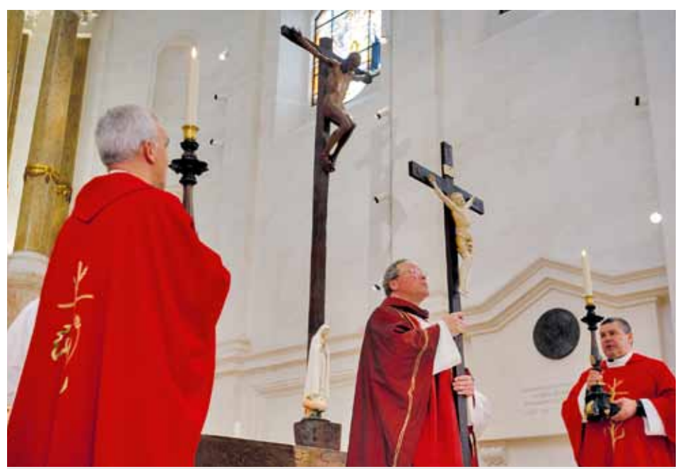
"The open arms of Jesus, nailed to the cross, visibly translate His willingness to embrace all men and women to offer them His boundless love."

Easter celebrations in Fatima were broadcasted the classical and digital media, all conveyed a message of hope