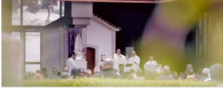
"We all know that we are going through days of worries, of a feeling of fear and insecurity, which is natural given the difficulties we are facing in terms of health, but we cannot help thinking that we are in good hands'

The Shrine of Fatima sought in this way to meet the demands of the moment, having as its priority the protection of the pilgrims and of its collaborators.