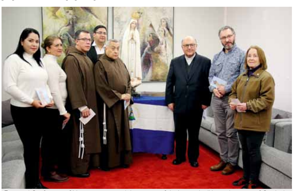
Episcopal Conference of Nicaragua accepted the request of the laity and will bring the image of Our Lady to all the dioceses of the country

This is just one of the journeys that the Pilgrim Virgin of Fatima will make as Ambassador of Peace this year. Argentina, Chile, the United States, Italy, Brazil, Spain and Portugal are some of the countries that an Image of Fatima will be visiting during the year 2020. These journeys will take place throughout the year, but it is between May and July that the greatest number of them will be made.