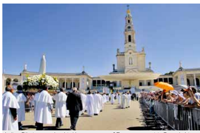
Italian Pilgrims are the third largest group of Europeans to visit Cova da Iria, after the Portuguese and the Spanish

Italian pilgrimages and all the institutions that organize pilgrimages in Italy. This pastoral organization set up specific commissions in charge of analysing and proposing solutions for pilgrimages and religious tourism in general, from the Christian perspective of a day of faith, simplifying the relations between sanctuaries and tourist operators, agencies and