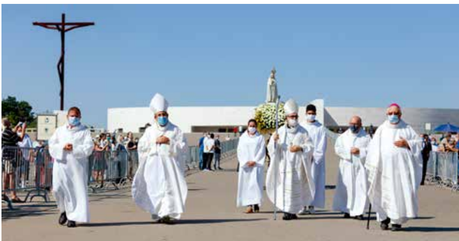
“We all need You, Mother, Lady of Fatima, because we all are and want to be your children, listening to your appeals and answering your invitations”

This was the second pilgrimage of the year to be celebrated with the Area open to the participation of pilgrims, after the confinement period imposed by the pandemic, following a briefer format, which suspended the Vigil Mass and the Vigil itself during dawn.