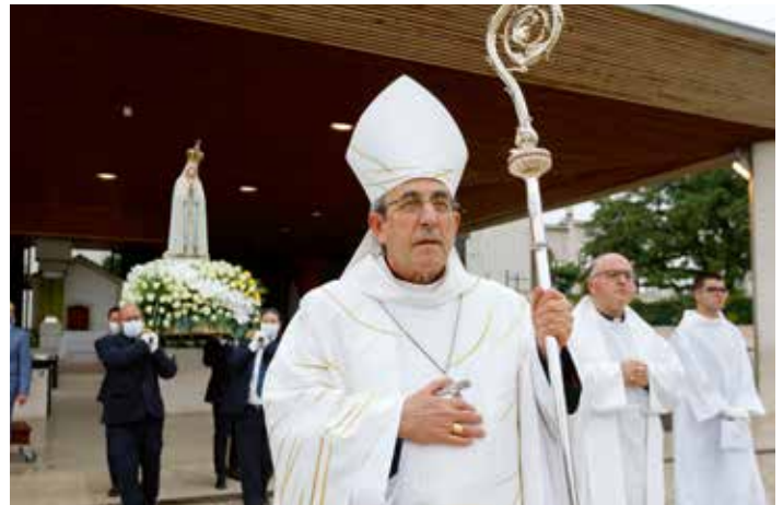
Bishop of Leiria-Fatima couldn't hide "the sadness on his soul"

version! Let us wonder if we have time for God, if we give Him the place He deserves in our heart and in our life", he furthermore stressed.