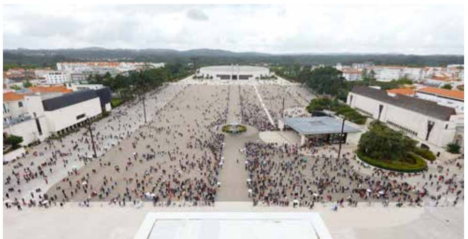
Thousands of pilgrims were present at the Prayer Area, complying with the social distancing protocol imposed at this time

The Auxiliary Bishop of Lisbon wanted to remind in the celebration the “State authorities, mayors, health professionals, elderly care institutions and charities professionals, families and informal carers”, people who “in the frontline and anonymously” take care of their brothers, and also the “fellow citizens who passed away”.