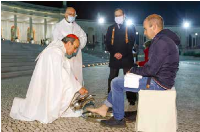
Cardinal repeats gesture of the Washing of the Feet, just like on Holy Thursday