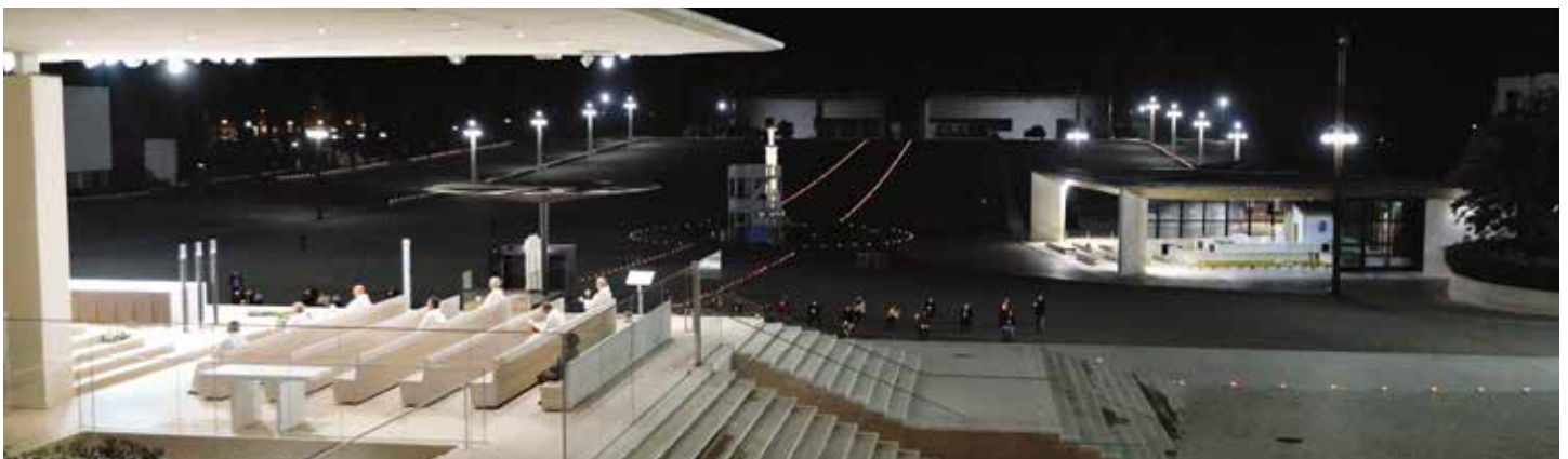
Physically absent from Cova da Iria, the pilgrims were the most present element in the celebration

"Today I would like to get close with my heart to the Diocese of Leiria-Fatima, to the Shrine of Our Lady: I salute the pilgrims praying there, I salute the Cardinal-Bishop, I salute everyone, all united with Our Lady, who accompanies us in this journey of daily conversion to Jesus. May God Bless you", he said during the live-streamed general audience taking place behind closed doors in the library of the Apostolic Palace.