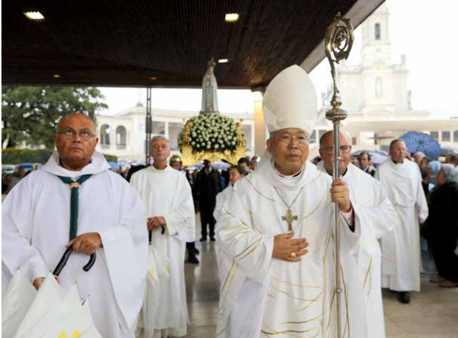
The South Korean Cardinal presided over the International Anniversary Pilgrimage of October, in 2019