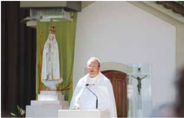
Rosary in Rome ended with the Ave of Fatima sung by the Vatican Choir

Marian shrines all over the world prayed together with Pope Francis