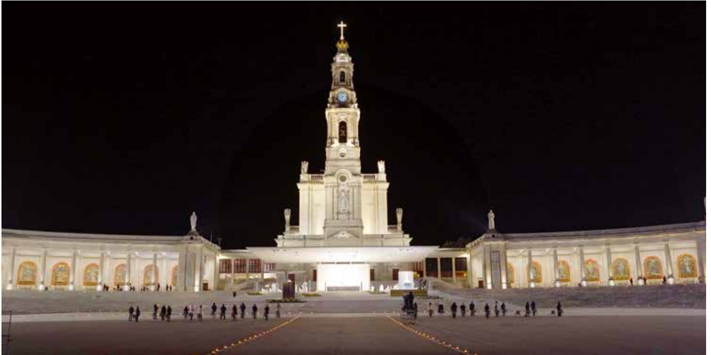
Minimalist celebration was only attended by the Shrine collaborators

For 24 hours, for the first time in its history, pilgrims could not enter the Shrine of Fatima / Carmo Rodeia