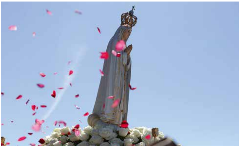
Statue venerated at the Little Chapel has been three times in the Vatican

the interpretation of the «Little shepherds», confirmed also recently by Sister Lucia, the “Bishop dressed in white” who prays for all the faithful is the Pope. Wearily walking to the cross between the corpses of those martyred (bishops, priests, men and women Religious and various lay people), he fell dead to the ground, under the blows of the firearm.»