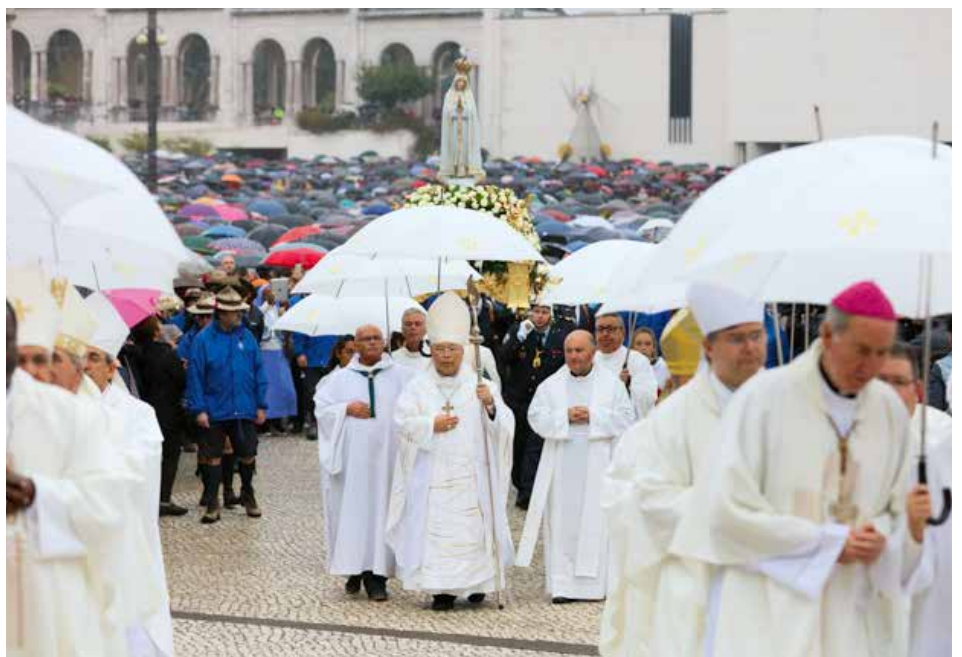
South Korea is one of the countries of the Asian continent which brings more groups to Fatima

The Shrine of the Peace of Fatima, located near the border between North Korea and South Korea, held a novena for peace on the Peninsula from August 22 to 30, 2017. After this period, the Pilgrim Virgin passed through 13 more dioceses. It is estimated that, during these 50 days in which the statue of the Lady of Fatima was in the country, about 55.500 pilgrims have accompanied Her. The image of the Pilgrim Virgin had already been to South Korea in 1978, during the pilgrimage around the world.