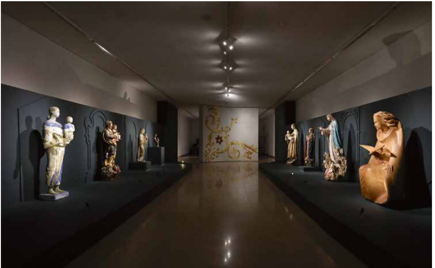
Exhibition celebrating the Centenary of the Statue worshipped at the Little Chapple of the Apparitions has been visited by 66 198 pilgrims

Hall, at the lower floor of the Basilica of the Most Holy Trinity, is scheduled to run until 15 October, and can be visited between 9:00 am and 12:45 pm (last entrance), and 2:00 pm and 5:45 pm (last entrance), from Tuesday to Sunday.