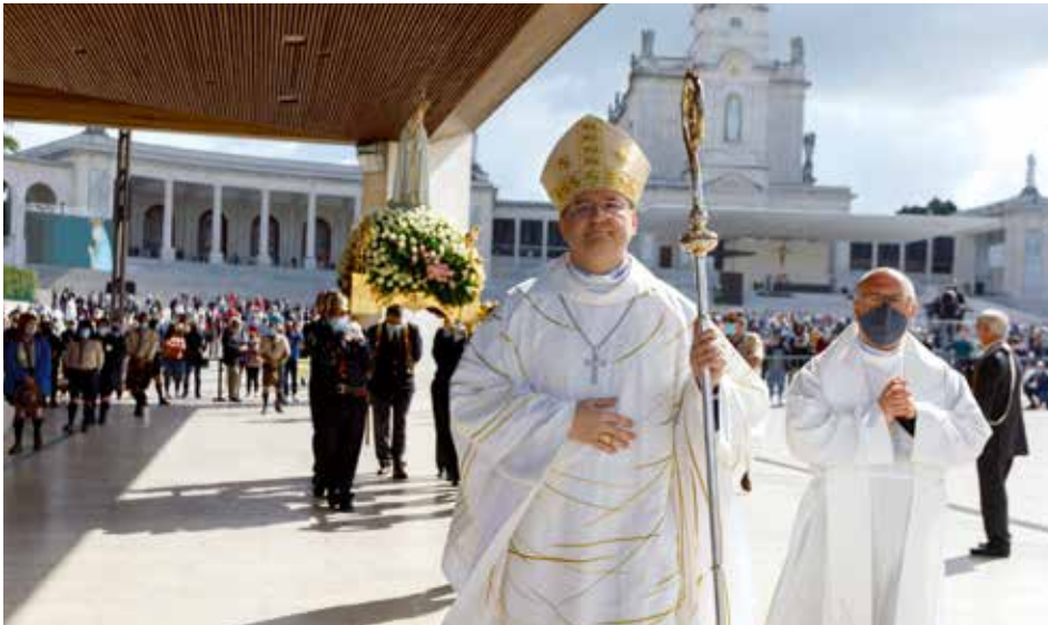
Auxiliary Bishop of Lisbon presides over an International Anniversary Pilgrimage at Cova da Iria for the first time