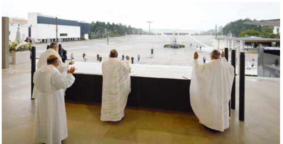
For the first time since 1917, the devout pilgrims were absent from the Shrine

“A better life in our common house, in peace with the creatures, with others and with God, a life full of sense requires con-