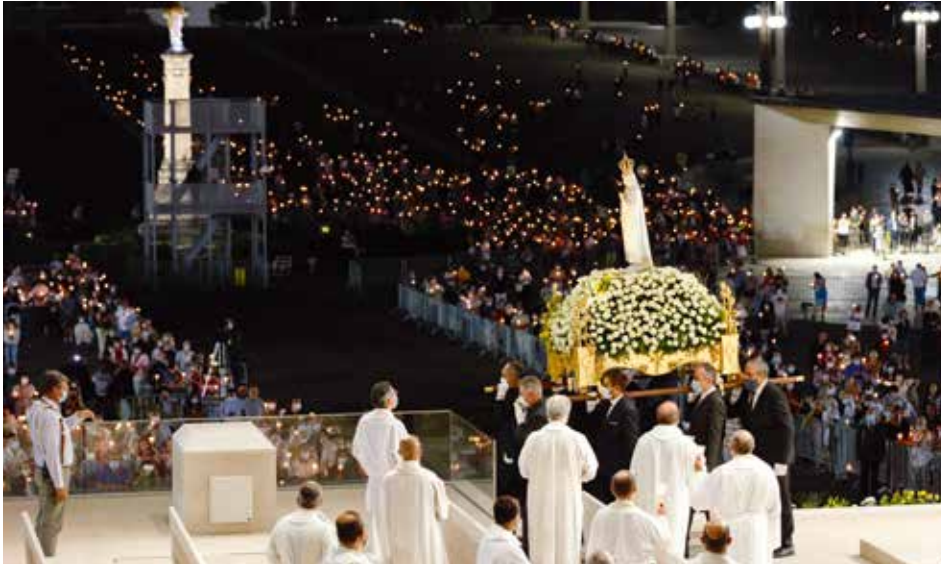
This was the second International Anniversary Pilgrimage of the year to be celebrated with the Area open to pilgrims