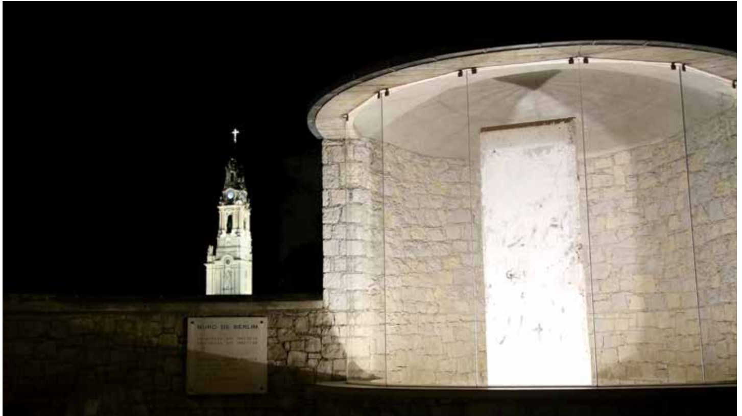
Every August 13, the Shrine always promotes a moment of prayer near the monument