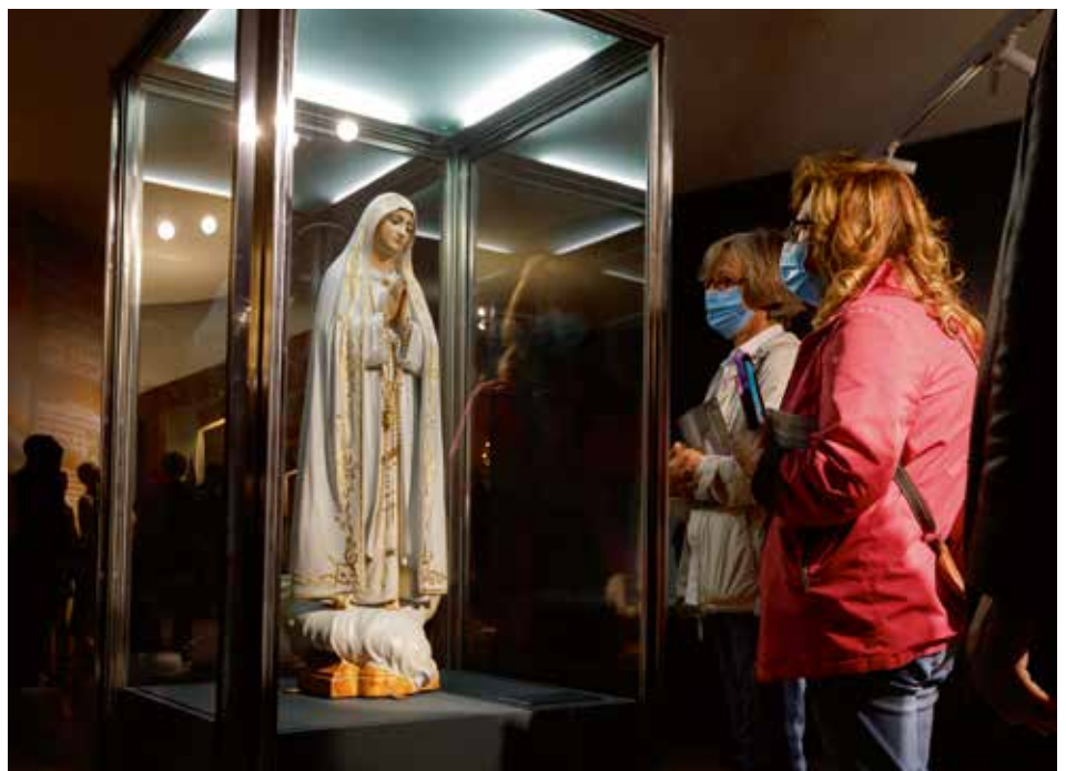
For six hours the statue was “closer” to the pilgrims