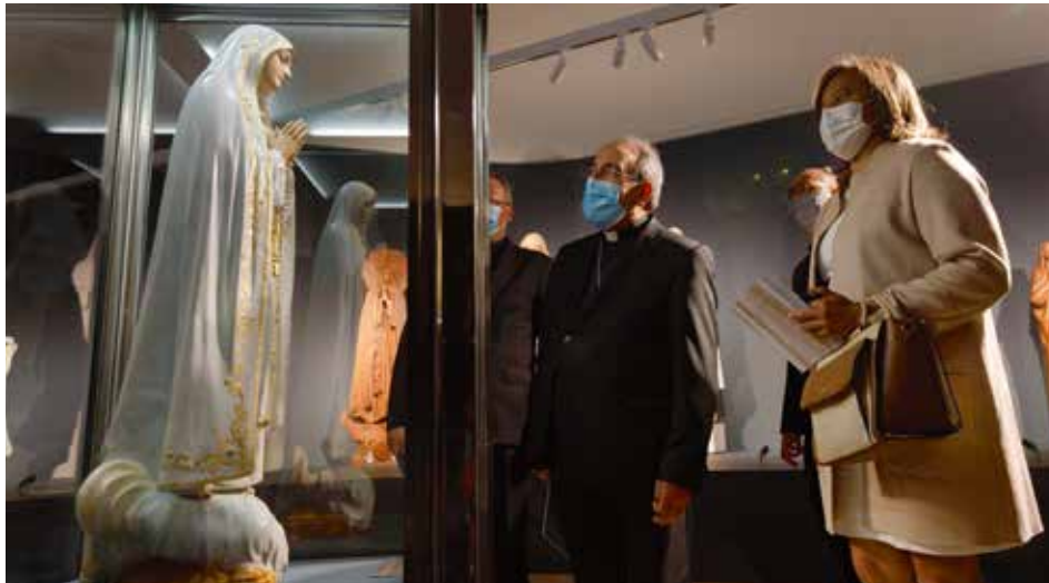
Shrine marked the event allowing a greater closeness between the Statue and the pilgrims

Temporary exhibition can be visited until October 15 / Carmo Rodeia