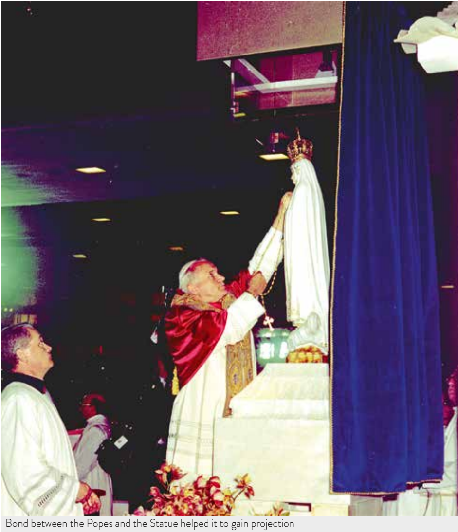
Bond between the Popes and the Statue helped it to gain projection