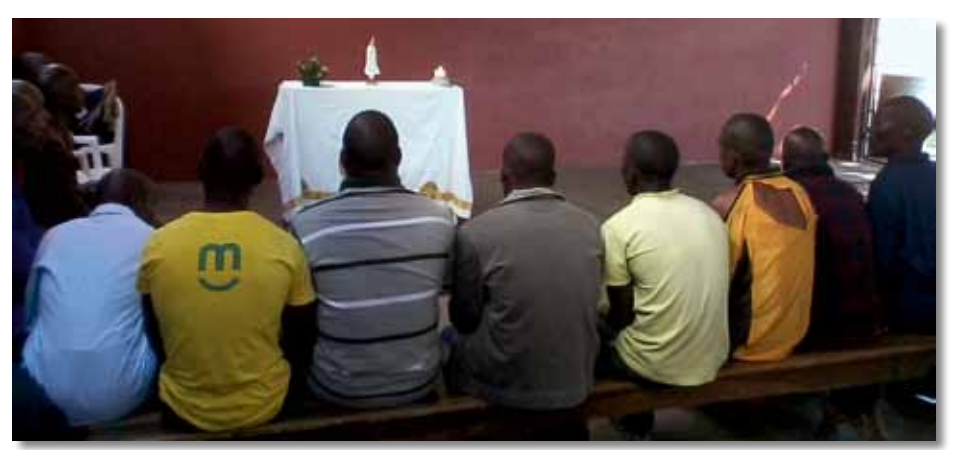
Deprived of freedom, but free to unite Heaven and Earth through Maria

A few weeks ago, a prisoner of the Maputo Central Penitentiary asked me if we could start praying the rosary in prison. I accepted with joy his request and suggested him the organization of prayer, asking the other inmates if they were interested in this initiative. On May 7, Wednesday, at 10:30 am, we met in the garage, where the Catholic community of prisonners is accustomed to pray and around a small and beautiful image of Our Lady of Fatima, offered by the Sanctuary of Fatima, we began to pray with a group of 17 inmates.