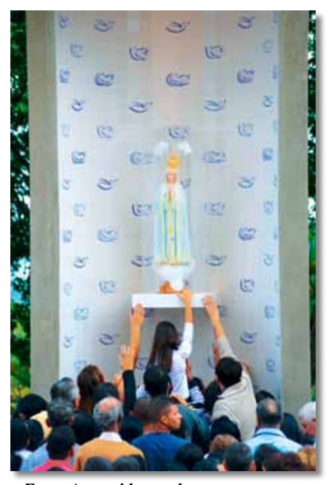
From Aparecida reach us some reports that the resident Portuguese community and other associated devotees come together regularly close to the image of Our Lady of Fatima, in particular the 13th of each month, to pray the rosary.

of Conception, venerated at that Brazilian sanctuary; the simultaneous recitation of the rosary, telecasted from both places, on some occasions in the years 2014, 2015 and 2016.