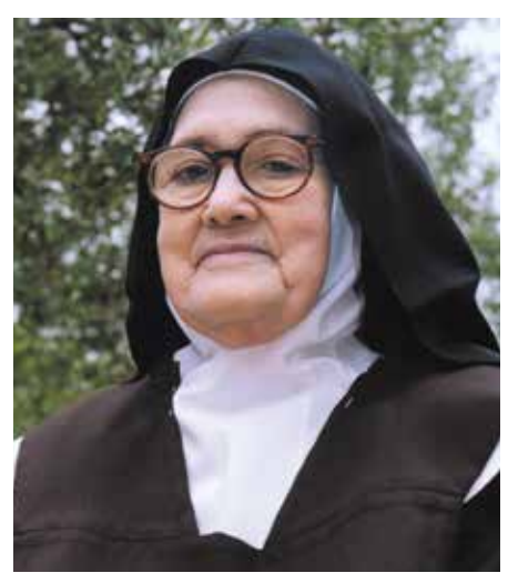
Sister Lucia deceased in February 2005

She was one of the three children who between May and October 1917 witnessed six apparitions of Our Lady in Cova da Iria, according to their testimonies, recognized by the Catholic Church. Concluded the diocesan phase of the beatification process, a 'position' will be elaborated, a compendium of the reports and studies carried by the juridical committee, by a relater nominated by the Congregation for the Causes of Saints (Holy See).