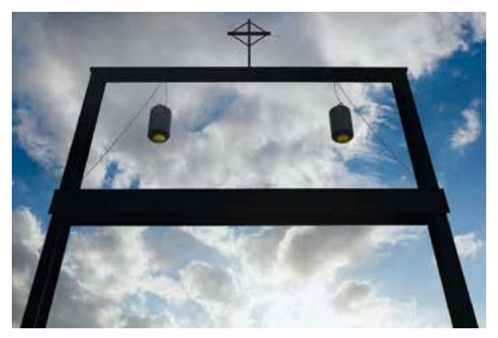
Centennial of the apparitions is marked by the Jubilee Portico

According to the Canon Law, to accomplish indulgence, which may be partial or plenary — as it partially or totally frees from the sanction due by the sinners — it is required, in addition to the exclusion of any sin fondness, the execution of the work prescribed by the Church, the Reconciliation sacraments (Confession) and the Eucharist, as well as the prayer by the Pope's intentions.