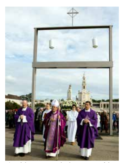
The Jubilee Portico marks the 100 years of the apparitions

"Fatima – Time and Light" is a Video Mapping show, scheduled for the nights of May 12th, 13th and 14th, in the Prayer Area of the Shrine of Fatima.