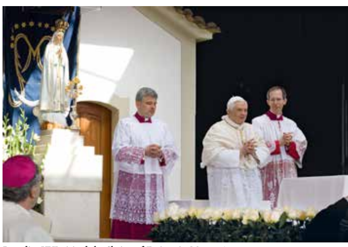
Benedict XVI visited the Shrine of Fatima in May 2010