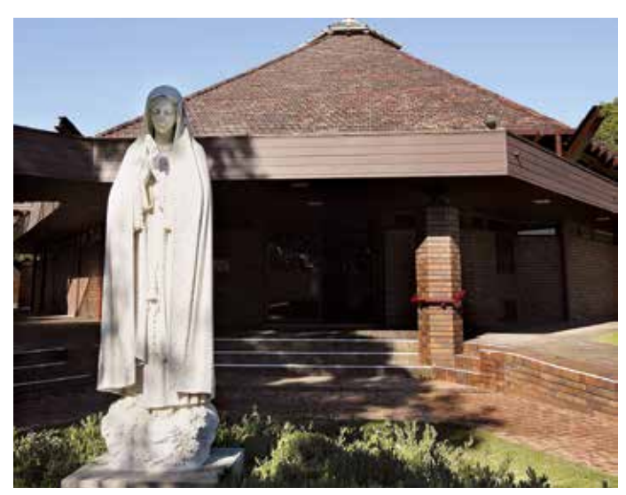
The Virgin of Fatima has a shrine in Sydney

In the Shrine of Fatima's archive there is reference to a parish dedicated to Our Lady of Fatima, near Beijing. An image of Our Lady of Fatima is found in the Everest peak. In Sidney, Australia, there is a Shrine dedicated