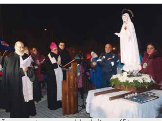
The region maintains a very strong link to the Message of Fatima

The municipality chose a small square just at the entrance of the city and gave it the name of "Oasis of Our Lady of Fatima", and on the same square was enthroned the image brought from the Shrine of Fatima and blessed in the Chapel of the Apparitions.