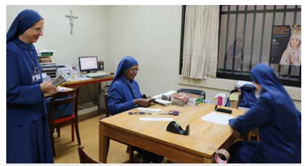
Oblate Sisters collect and sort the letters that come with the prayer requests

Messages that tell the story of Fatima and of the world / Diogo Alves