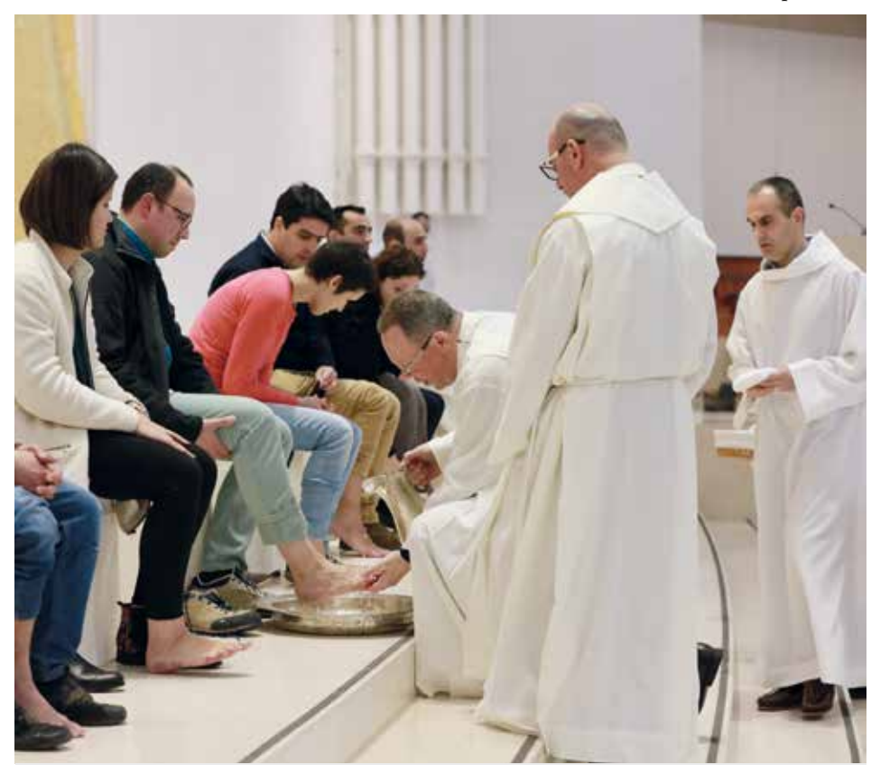
The Mass of the Lord's Supper was attended by the collaborators of the Shrine of Fatima

With Easter started a new celebratory agenda in the Shrine of Fatima, which can be consulted at www.fatima.pt.