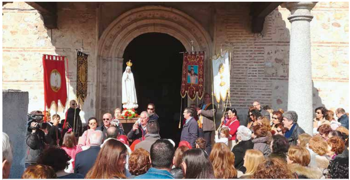
An intense program of prayer had been prepared to receive the Pilgrim Virgin

The visit took place from the 13th to the 25th of February in a festive and worshipping atmosphere