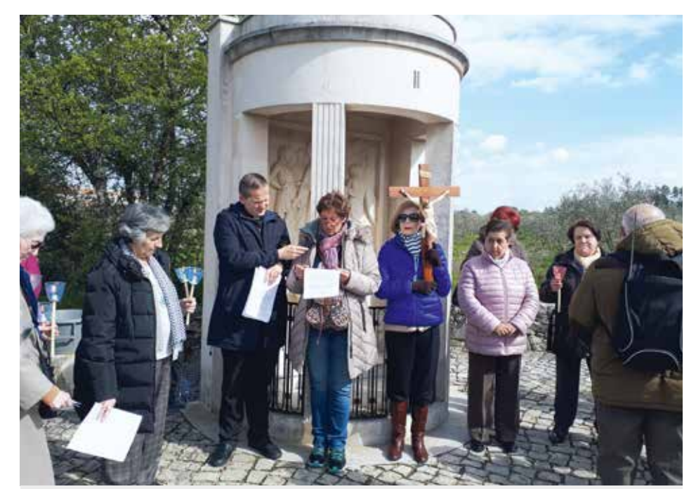
The Via Sacra was a subject of meditation on the Path of the Little Shepherds

On our way back home, the testimonies of the pilgrims who had joined us revealed that all of them were full of love for the Blessed Virgin, filled with spiritual grace and that they were all expecting to return to Fatima in the years to come, should God and Our Lady