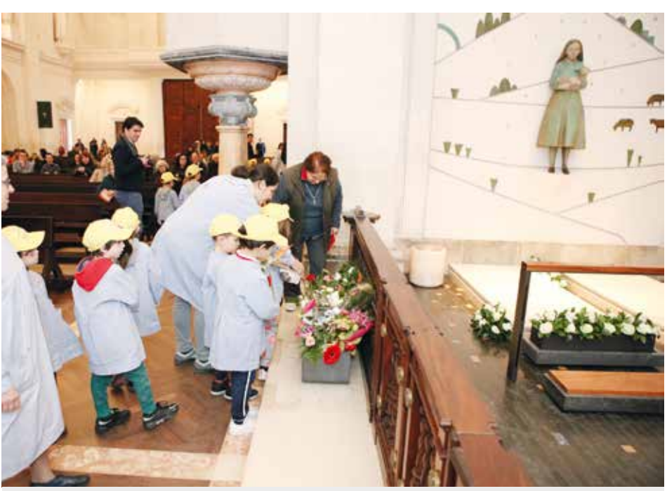
It already became a tradition for the children to give flowers to the Little Shepherds

After that, there was a visit to the graves of the Little Shepherds in the Basilica of Our Lady of the Rosary of Fatima.