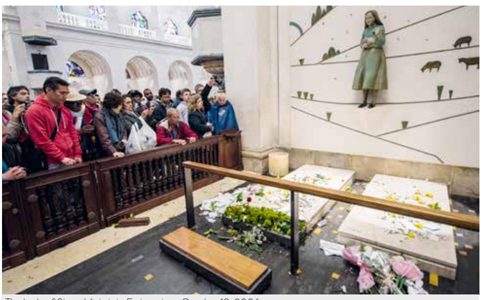
The body of Sister Lúcia is in Fatima since October 19, 2006