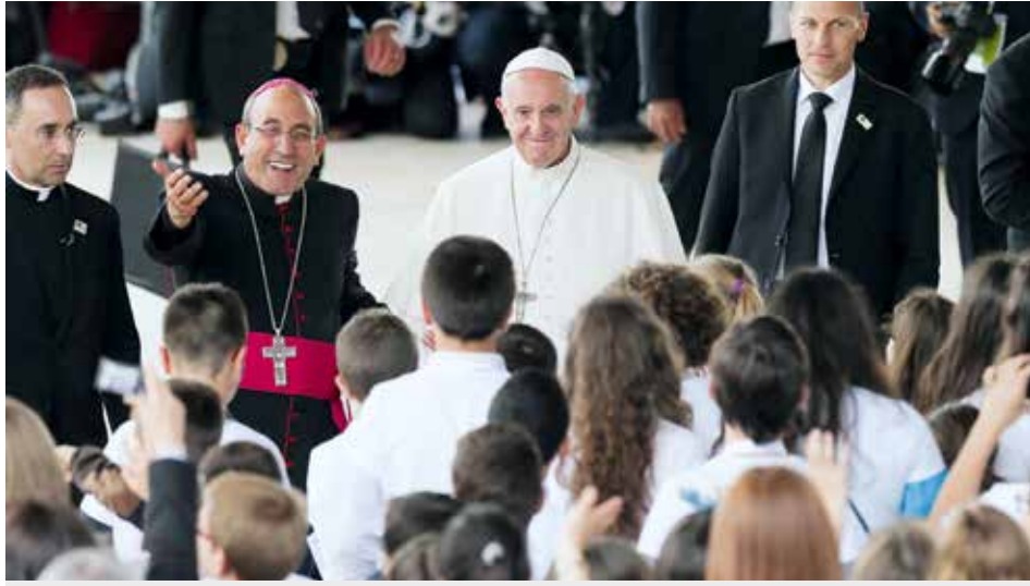
Simplicity and proximity are the main characteristics of Pope Francis

In the speeches he gave in Fatima, Francis called for peace and harmony and recalled those who are excluded from the society as