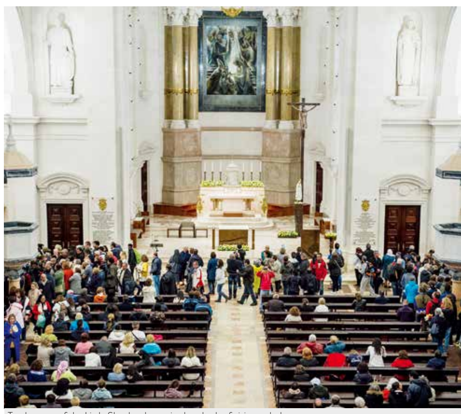
Tombstones of the Little Shepherds receive hundreds of visits each day

"People frequently ask for relics. This phenomenon also is exponentially increasing, and the requests we receive come from all the parts of the world, from Australia to Eastern Europe, without mentioning Latin America," the sister said, reminding though that "really objective and clear" criteria are defined for the transfer