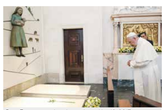
Pope Francis prayed on the tombs on May 13, 2017

"People are moved by their example and, above all, by how they dedicated themselves to God," said Angela Coelho referring to the Prefect of the Congregation for the Causes of Saints himself, the cardinal Angelo Amato, who always shown how deeply touched he was by this cause; without forgetting the Pope, who still makes fre-