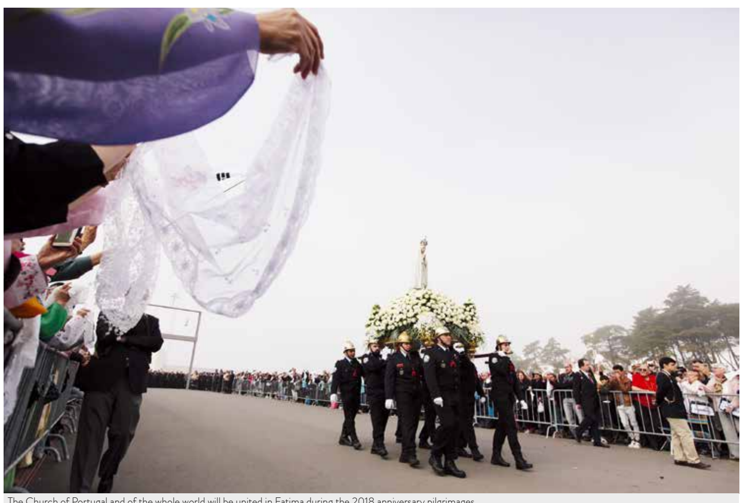
The Church of Portugal and of the whole world will be united in Fatima during the 2018 anniversary pilgrimages

The Bishop emeritus of Hong Kong and the Bishop of Hiroshima will be presiding the opening and closing celebrations of the international anniversary pilgrimages in May and October / Carmo Rodeia