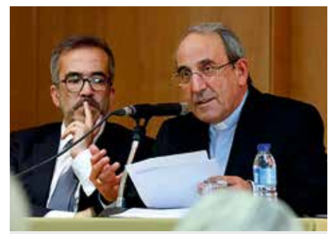
The message of Fatima shows a real experience

"The bright shade of Fatima spreads over the entire twentieth century, probably the most cruel