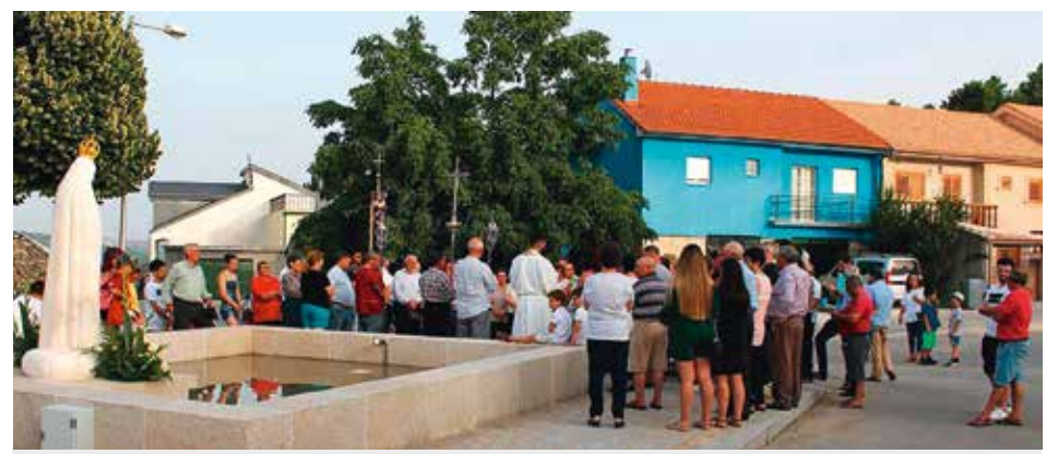
New place of cult to Our Lady in Sabrosa

This new religious site is intended to be a place of worship for the catholic community