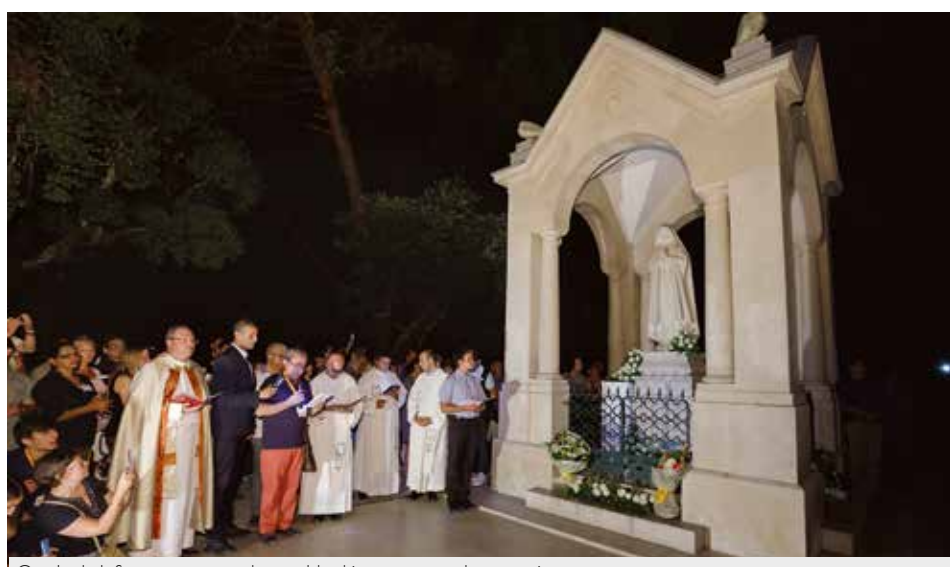
Our Lady left a message to the world asking prayer and conversion

In the Prayer of the Faithful, which remembered the families, the excluded, the sick and the young, a special prayer was made and dedicated to the public authorities, namely to the cultural, political and religious authorities, in order to "courageously engage with the values of justice, love and peace" and "for them not to get tired of seeking dialogue as resolution path for conflicts".