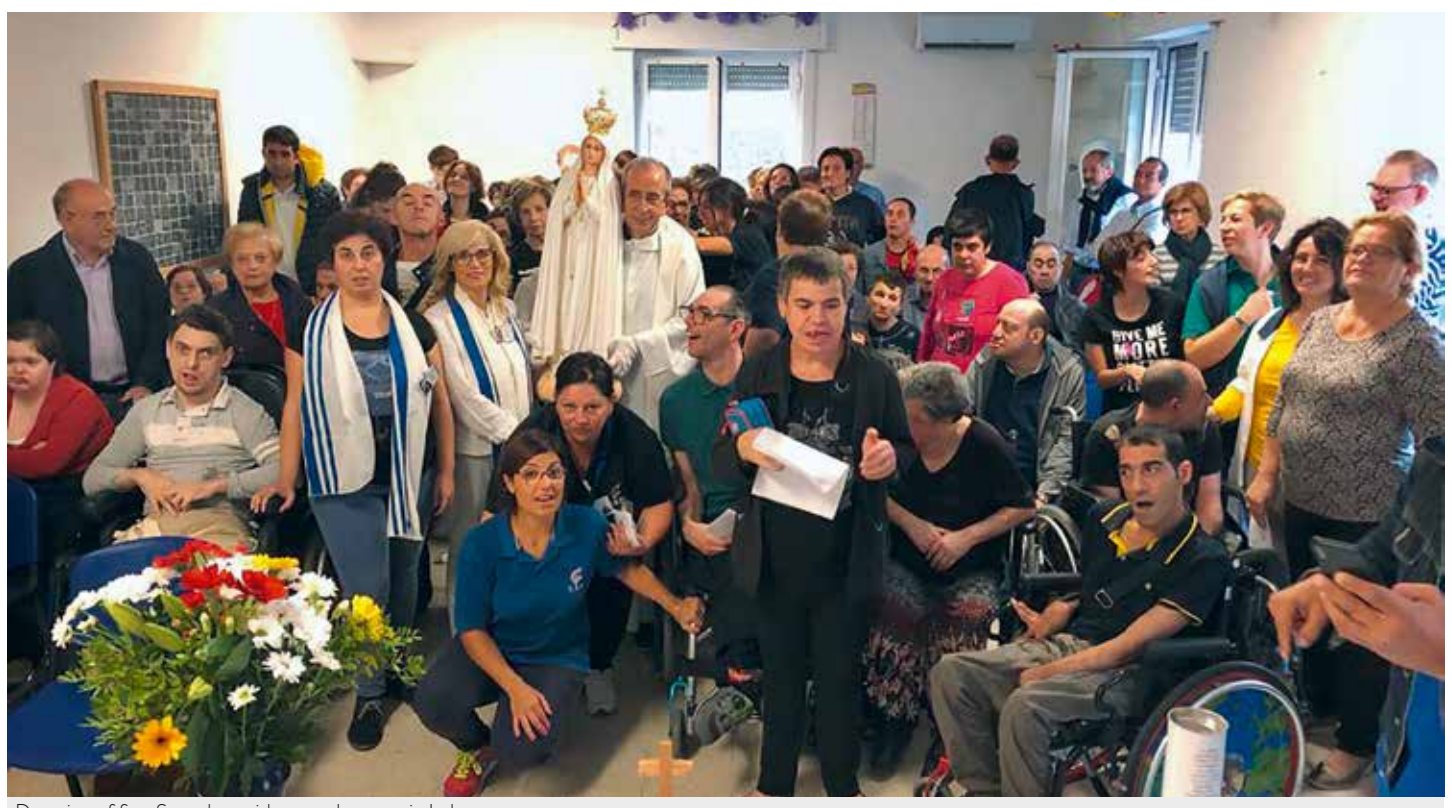
Devotion of first Saturdays with more devotees in Italy