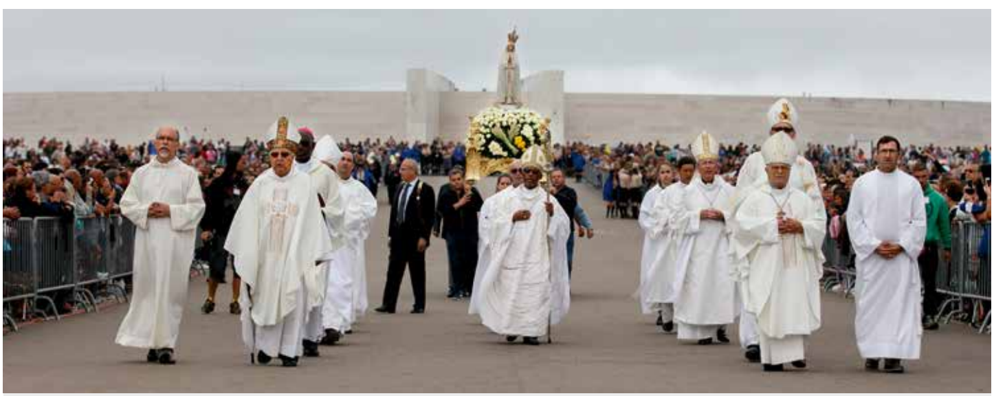
Cardinal of Cape Verde presided at the pilgrimage dedicated to the migrant and the refugee

Besides the two cardinals, the celebration of the 13<sup>th</sup> was concelebrated by five bishops and 121 priests.