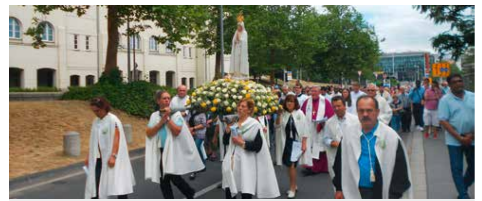
Pilgrim Virgin visited the Grand Duchy of Luxembourg

The purpose of this pilgrimage was to give thanks for the gift of spirituality that the visit of the Pilgrim Statue meant/Rul Pedro