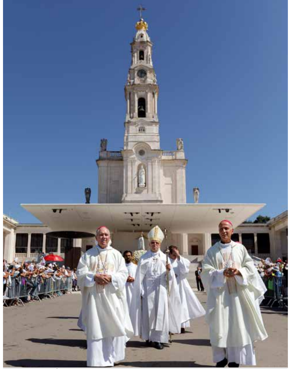
Bishop Emeritus of Évora more active Christian communities

Cardinal Antonio Marto asked at the beginning of the Anniversary International Pilgrimage of September for the special protection of Our Lady so as the current problems of the Church to be overcome and peace in the world to be reached.