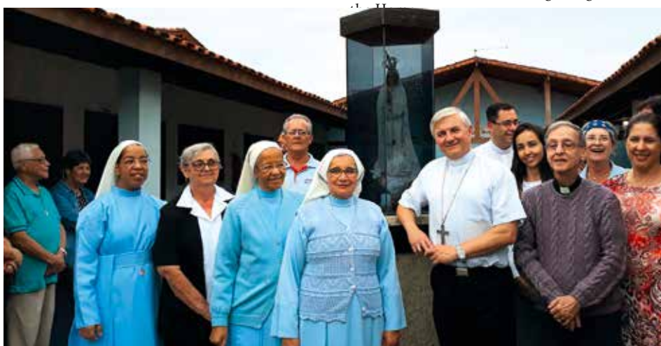
The tribute to the Virgin Mary exists because Recanto is a religious institution

Recanto is a religious institution and therefore we felt the need to honour the Virgin Mary, Mother of God and our Mother. As the devotion to the Virgin Mary is a constant among the Brazilians, here we have the presence of the Religious Missionaries of Our Lady of Fatima who make the religious guidance of