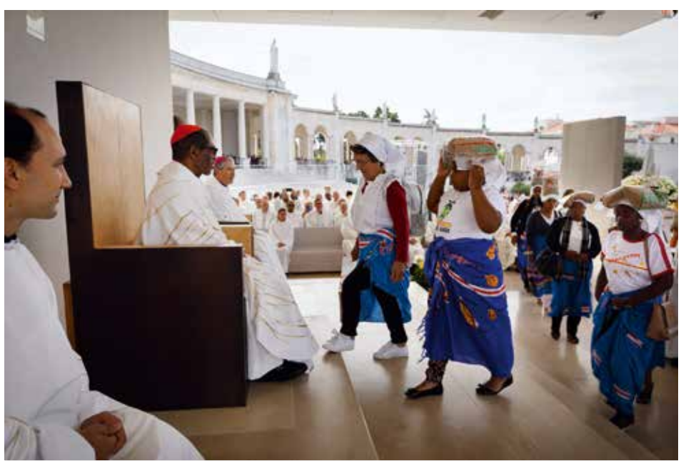
The offering of wheat is one of the most important moment of the pilgrimage

The pilgrimage of August challenges public authorities to give priority to the wave of migration / Carmo Rodeia