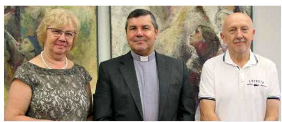
Portugal and Poland are united in the cult to Our Lady of Fatima

The programme also included a visit to Aljustrel and Valinhos, as well as taking part on a ceremony in the Chapel of the Apparitions.