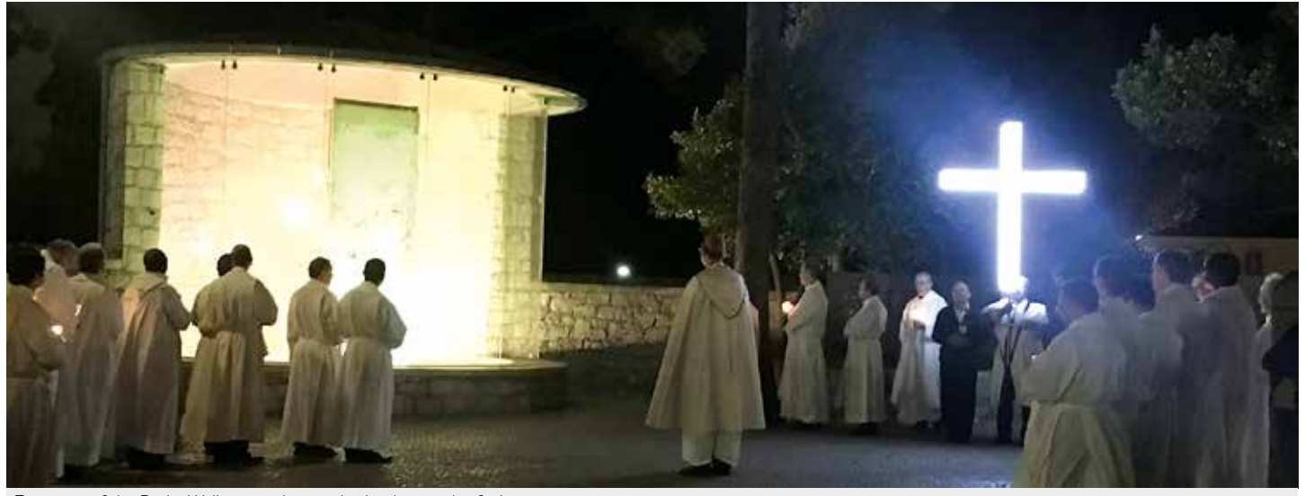
Fragment of the Berlin Wall is visited every day by thousands of pilgrims