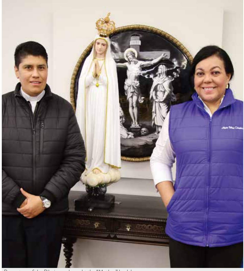
Promotors of the Pilgrimage brought the "Mother" back home