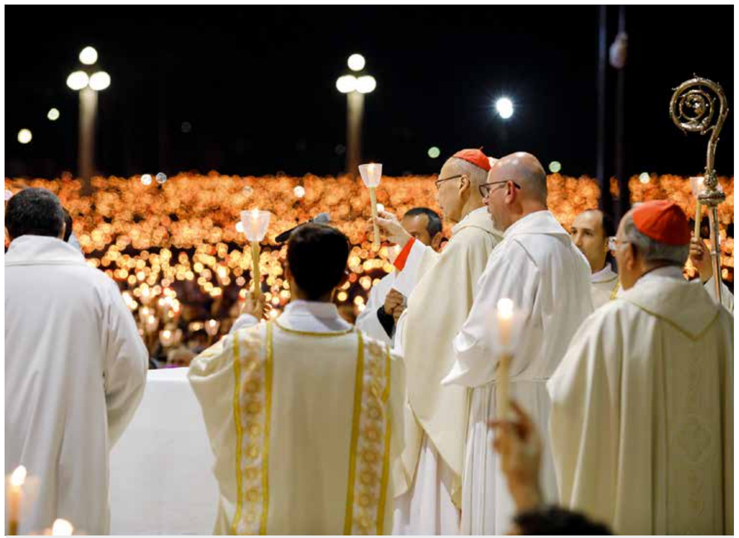
The Shrine of Fatima turned towards the Asian Continent

The main celebrants of the pilgrimages of 2019 are already known / Cátia Filipe