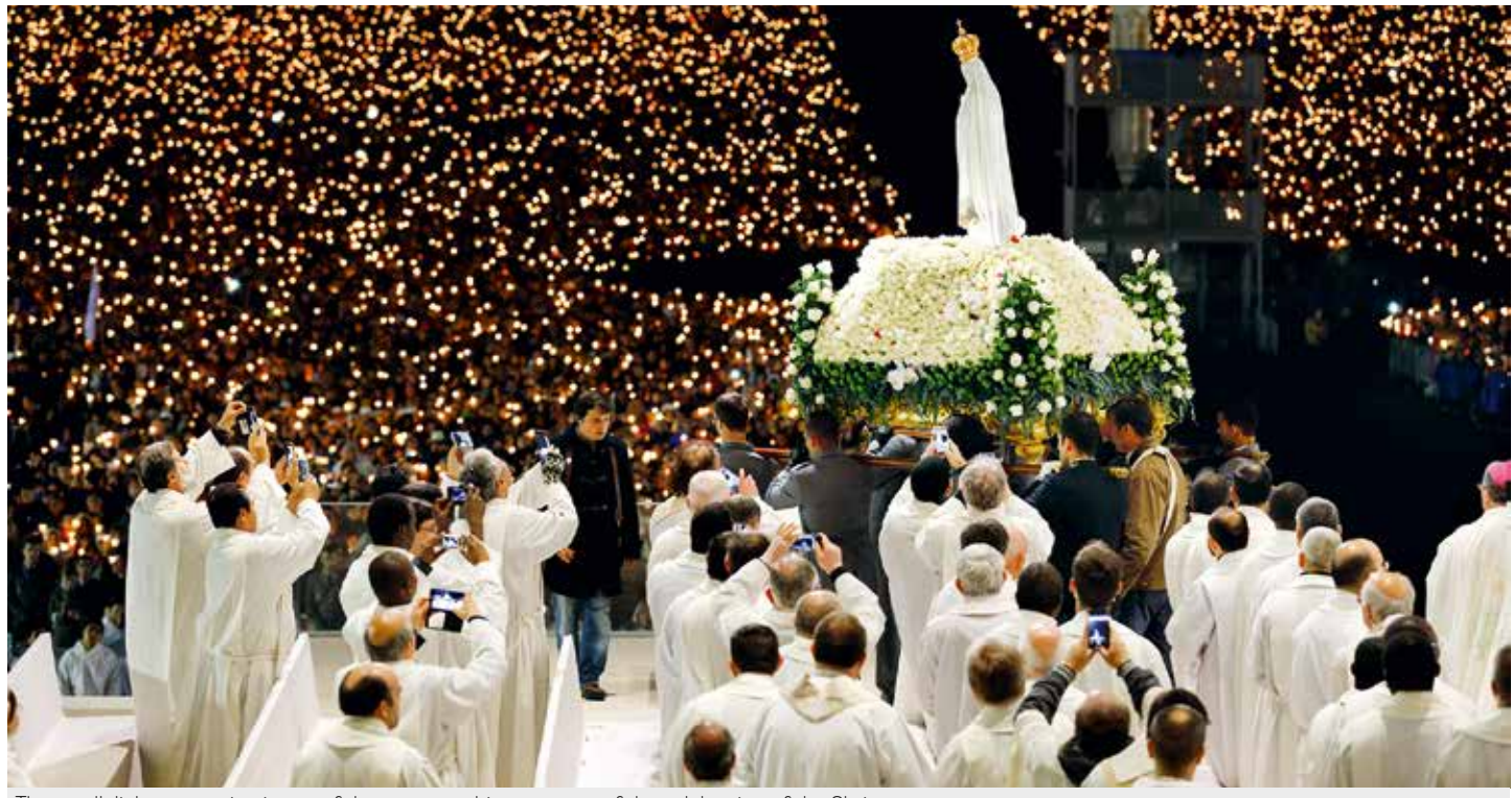
The candlelight procession is one of the most touching moment of the celebration of the Shrine

The Shrine remains one of the most sought-after site by Christians. Nine out of the ten countries that concentrate more than 55 % of the Catholics of the world go on pilgrimage to Cova da Iria every year.