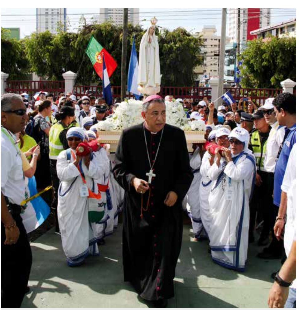
The Pilgrim Virgin Statue travelled the peripheries of Panama City

The best strategy for organizing such an event is to place it in the hands of God and ask for the intercession of Mary. We have to do everything that is possible from the human point of view, but it is the providence that protects us. That is why we