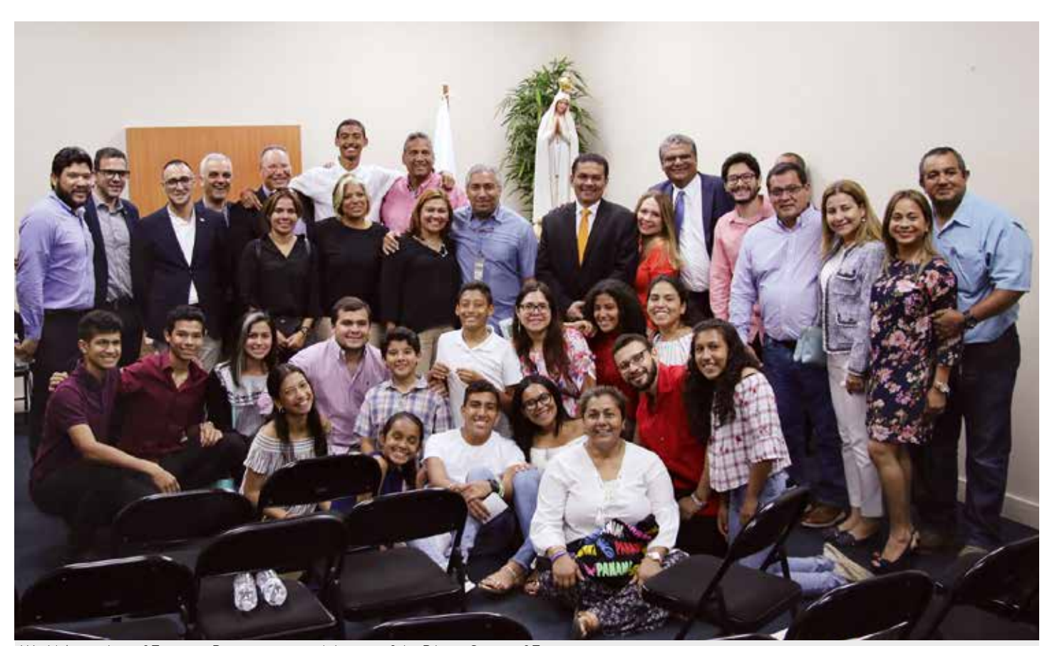
World Apostolate of Fatima in Panama organized the visit of the Pilgrim Statue of Fatima