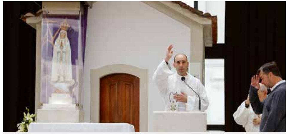
Departure of the Pilgrim Statue of Fatima marked by prayer for Peace and for the Holy Father

The program of this journey includes a visit to 26 dioceses over a year