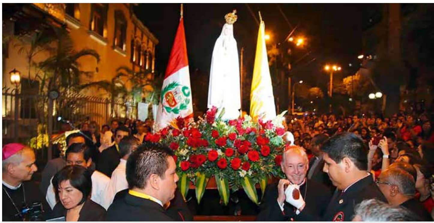
"We have no words to describe the experience of love we've lived before the Blessed Virgin Mary"

"I was deeply impressed when reading about these three children. After they had seen all that the Virgin showed them, they did so much to save souls! So, I ask myself: what will be our mission? What does she call us to do?", she points out, recalling that today "it's clear that everything that happened in Colombia was through the intercession of Our Lady".