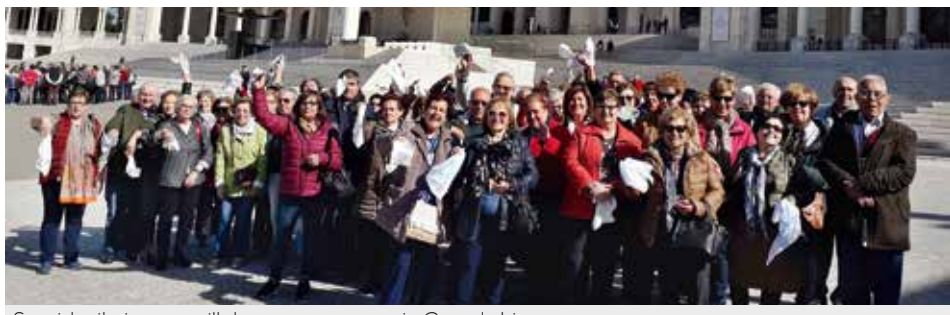
Spanish pilgrims are still the most numerous in Cova da Iria

We give infinite thanks to Our Lady for allowing us, once again, to visit her and show her our filial and faithful love.