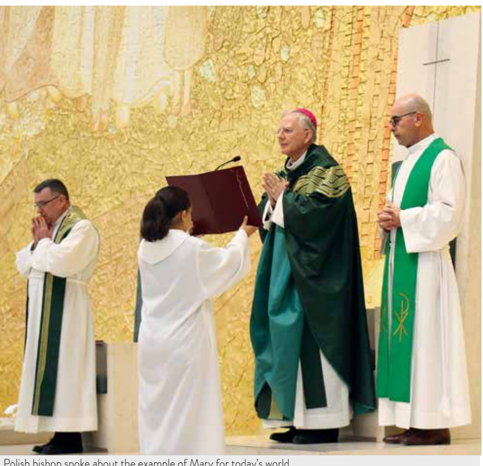
Polish bishop spoke about the example of Mary for today's world

"Her monthly manifestations to the three Little Shepherds, the promises to take them to Heaven and, above all, her fervent requests and appeals, show how Our Lady of the Rosary dwells on each Man with her motherly love, aiming at his salvation", he concluded.