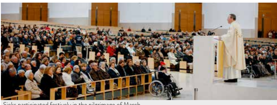
Sicks participated festively in the pilgrimage of March

Focusing on the call for conversion which is part of the Message of Fatima, the president of the celebration referred to the commitment assumed by Saint Francisco