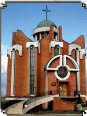
Shrine of Our Lady of Fátima in Wrocław, Poland

We remind you that this exhibition will be inaugurated during the international congress 'Fátima for the XXI Century' and its purpose is to make known the many shrines dedicated to Our Lady of Fátima in all five continents.