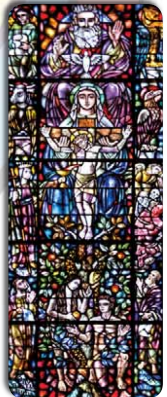
'The Tree of Life', Owner: Divine Word Missionaries, Fátima

Let us remember that, at the time of the international theological congress 'Figures of the Angel Revisited' in October of 2006, the same museum received, from October 2006 to March 2007, an exhibition of angelic iconography titled 'I am the Angel of Peace'. This sample was visited by 3275 people.