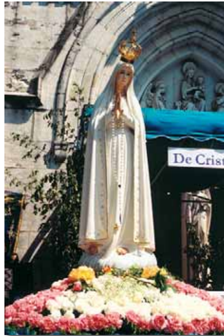
Image blessed by the Bishop of the Diocese of St. Claude on May 12, 1968.

The Committee in charge is going to make, on the 12/13th of May, 2007, the 40 th pilgrimage to the Shrine of Mont-Roland, Dole, France, in praise and honor to Our Lady of Fátima, under the motto 'Christ Light of the World'. (...)